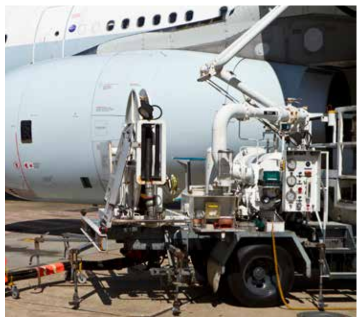
REFUELING OF COMMERCIAL AIRLINE

The European Union's Renewable Energy Directive (RED) establishes renewable energy mandates (20 percent of E.U. energy by 2020), including a renewable transport fuels target (10 percent of road and rail energy). A fuel's eligibility is contingent on criteria such as land use change