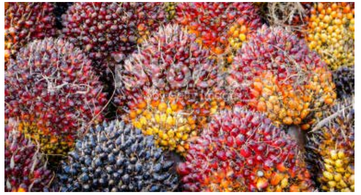
PALM OIL FRUITS

Airlines have generally engaged in standards development through participation in industry organizations working on this topic. SAFUG and CAAFI are the two primary such bodies. Through SAFUG there have been a number of important efforts to create regional road maps for aviation biofuel commercialization, and some collaborative organizations have been formed among airlines, local biofuel developers, policymakers, non-government organizations, and other stakeholders to study and promote regional development of aviation biofuels (for example, SAFN