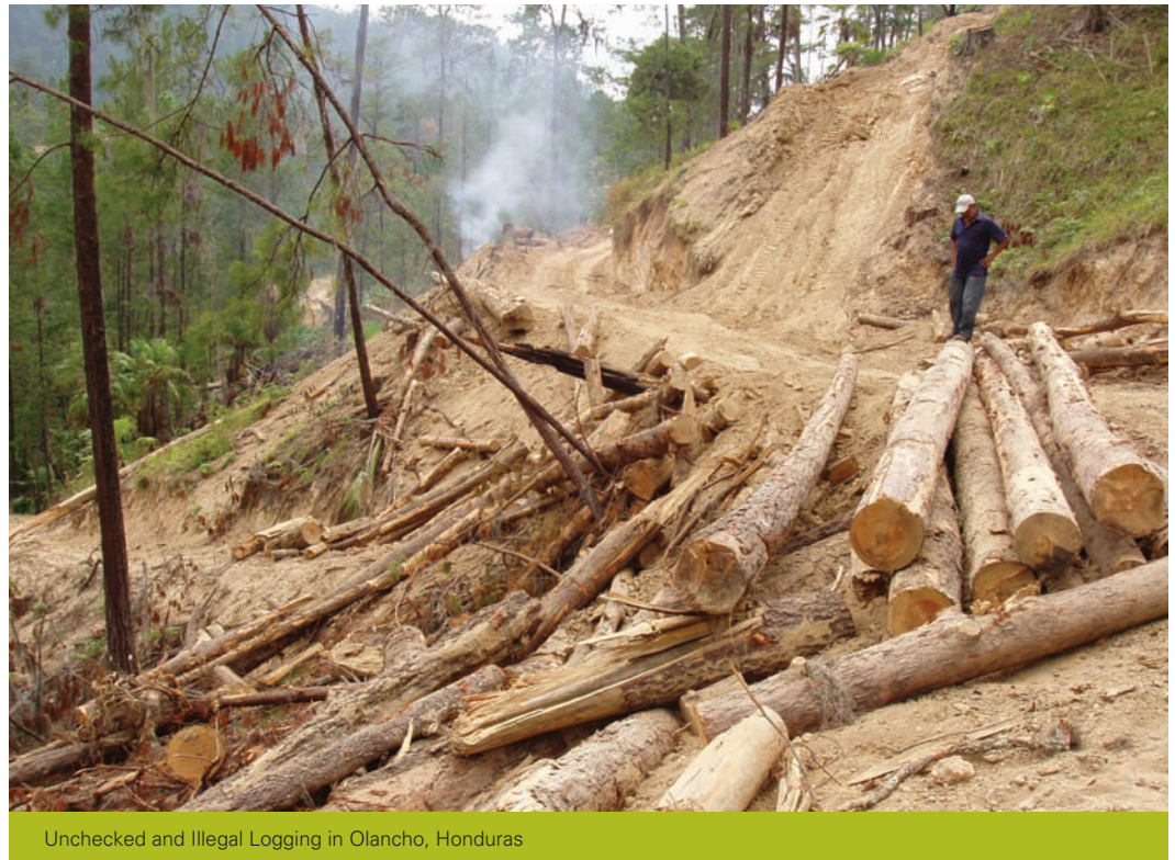
Unchecked and Illegal Logging in Olancho, Honduras