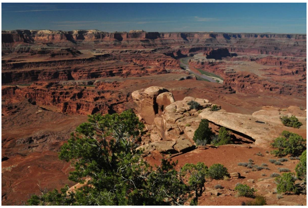
Fig. 3: The view from Canyonlands Overlook

168. Indeed, BLM recently received an expression of interest for a new oil and gas lease on lands that President Trump removed from the Monument near the popular Hatch Point and Canyonlands Overlook. According to BLM's website, this lease could be offered for sale as soon as March 2020. See BLM, Utah Oil & Gas Lease Sales, at <a href="https://www.blm.gov/programs/energy-and-minerals/oil-and-gas/leasing/regional-lease-sales/utah">https://www.blm.gov/programs/energy-and-minerals/oil-and-gas/leasing/regional-lease-sales/utah</a>.