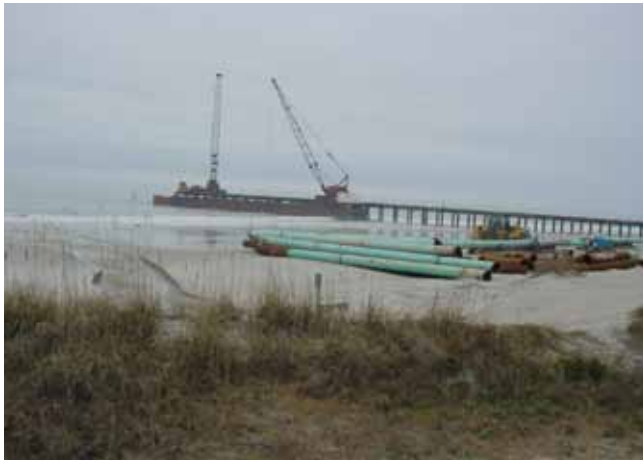
Converting Deep Head Swash's stormwater outfall to a deep-ocean outfall in Myrtle Beach in 2006.

Myrtle Beach (8%), and Briarcliffe Acres Beach (6%) in Horry County; Edisto Island in Colleton County (5%); and Sullivans Island in Charleston County (5%). Horry County had the highest exceedance rate (7%) in 2010, followed by Colleton (5%), Beaufort (2%), and Charleston (1%) counties. There were no exceedances in Georgetown County.