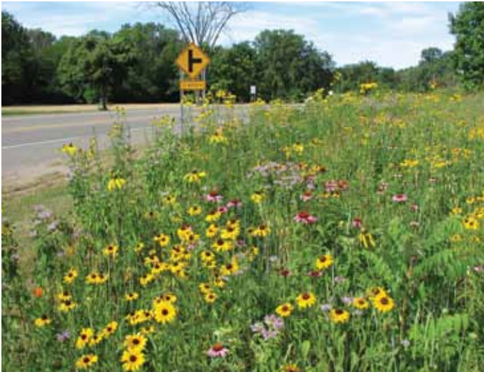
The Rouge Project, the Alliance of Rouge Communities, and the Michigan Department of Environmental Quality advance the use of green infrastructure to address stormwater runoff in the Rouge River watershed by transporting excess stormwater through a second, “green” conveyance system.

While the early focus of water restoration efforts was on controlling CSOs, such controls alone were insufficient to reverse the river’s state of decline. Stormwater runoff, as well as discharges from illicit connections and failed on-site septic systems, had led to excessive flows into the Rouge River, eroding 60 to 90 percent of its banks, damaging riparian habitat, and introducing pollutants. 5 Eight water quality monitoring stations were installed; then data showed that standards for dissolved oxygen were met only 30 percent of the time. 6 Without addressing these issues, CSO controls alone would fail to solve the problem. Wayne County also determined that before the river could be fully restored, its wetlands, habitat, and lakes also had to be restored. In response, the county shifted its restoration focus in the early 1990s, expanding its wet weather pollution controls to include green infrastructure practices and wetland restoration projects and forming the Rouge River Project with funding support from the EPA. 7 The overarching Alliance of Rouge Communities (ARC), which helps oversee implementation of the watershed-wide National Pollutant Discharge Elimination System (NPDES) permit for stormwater discharges, is maintained largely by membership dues of its participating communities and project grants, 8 with Michigan’s Wayne County playing a leadership role.