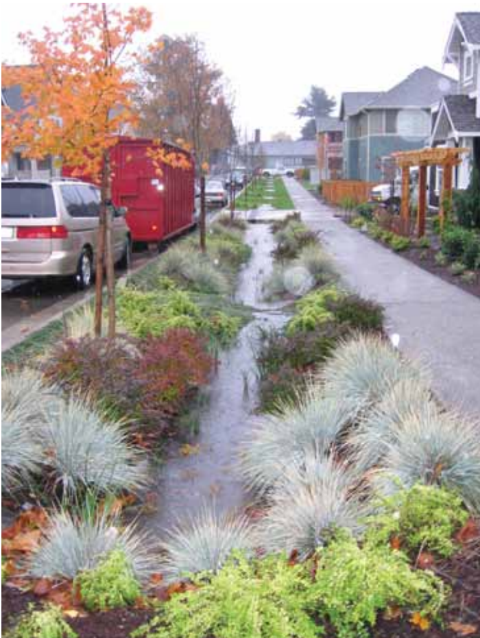
Seattle's Green Factor Program, a landscape requirement designed to increase the quantity and quality of planted areas in parts of the city, was the first of its kind in the United States. While developers and designers have flexibility to meet the requirements, the program does encourage the use of large plants and green roofs in publicly visible areas. Its scoring system provides bonuses for food cultivation, native and drought-tolerant plants, and rainwater harvesting.

Seattle's network of sewer and drainage systems is the responsibility of Seattle Public Utilities (SPU). The system includes approximately 968 miles of combined sewers with 92 permitted CSO outfalls, 38 CSO control detention tanks/pipes, 448 miles of sanitary sewers, and 460 miles of storm drains with 170 storm drain outfalls. 1 During heavy rains, the combination of stormwater (about 90 percent of the volume) and sewage exceed the drainage system's capacity, causing annual overflows of approximately 100 million gallons per year (down from 30 billion gallons in 1970). 2 SPU's approach to green infrastructure as it relates to stormwater and CSO control involves the testing of technologies or projects as pilots and then rolling out programs with broader application. SPU's Green Stormwater Infrastructure (GSI) program also supports the use of GSI at the site level through full street right-of-way improvements with natural drainage systems and through larger development planning and design. Factors such as Seattle's hilly topography, soil conditions, and street widths limit the sites for which GSI solutions are appropriate.