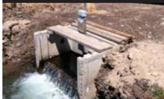
Figure 1: Reclamation District 108's new water measurement system.

Reclamation District 108 presents a useful example of a district that measures water deliveries. This district is in the process of modifying all 600 field turnouts and pump discharges to provide turnout measurements that meet the accuracy standards required by the state regulation. This includes the addition of a concrete weir box on all field turnouts and either a weir box or, if not possible, a flow meter on each lift pump. The weir boxes will include a bracket to facilitate the use of portable acoustic Doppler flow meters, which will be used by district water workers to take point measurements whenever the flow through the field turnout is changed (Figure 1). The acoustic Doppler was lab-tested and certified at the California State University Chico Agricultural Teaching and Research Center in July 2012 as meeting the accuracy requirements of the regulation. The flow meters also serve to record each data point and automatically transfer the information to a server in the district office where quality control, monthly reporting, and billing is performed. The plan proposes to complete the capital improvements and data management processes prior to the 2016 irrigation season.