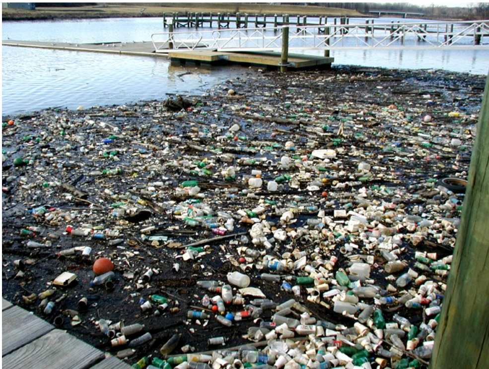
Large Trash in Stream Along Central Ave.