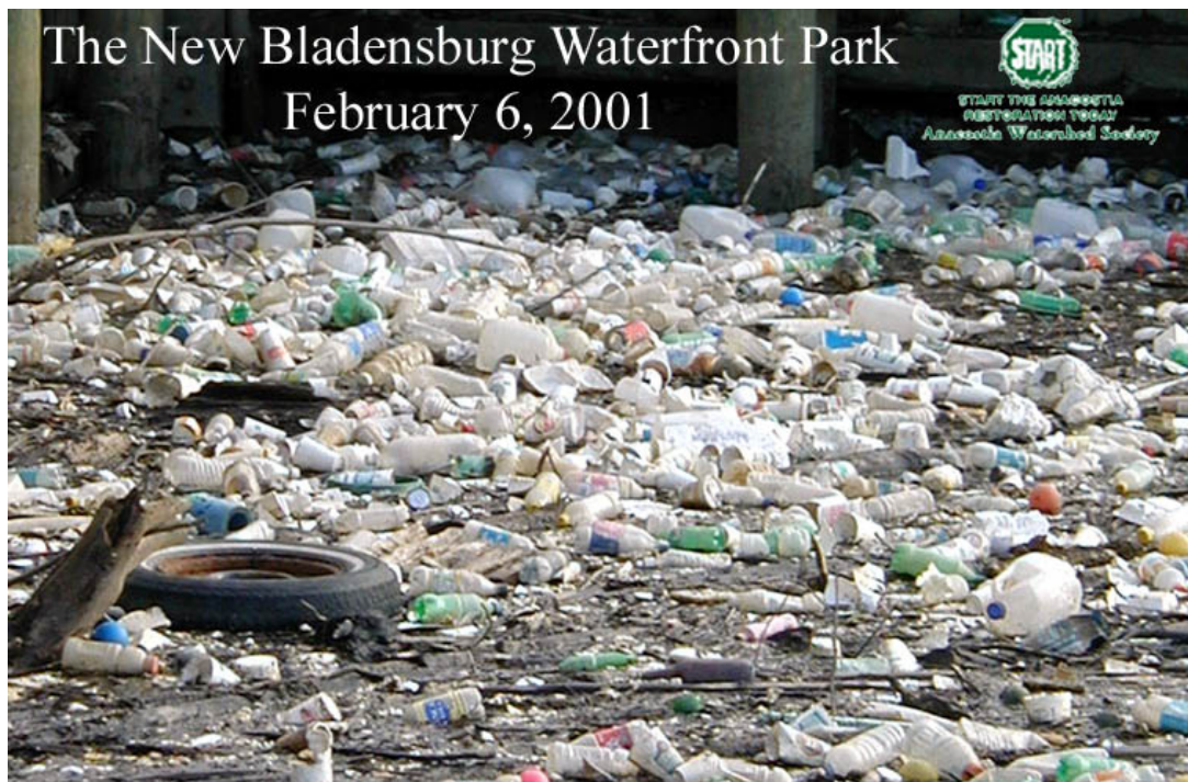
Trash at Bladensburg