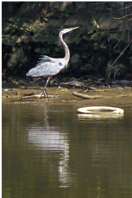
Heron and Tire