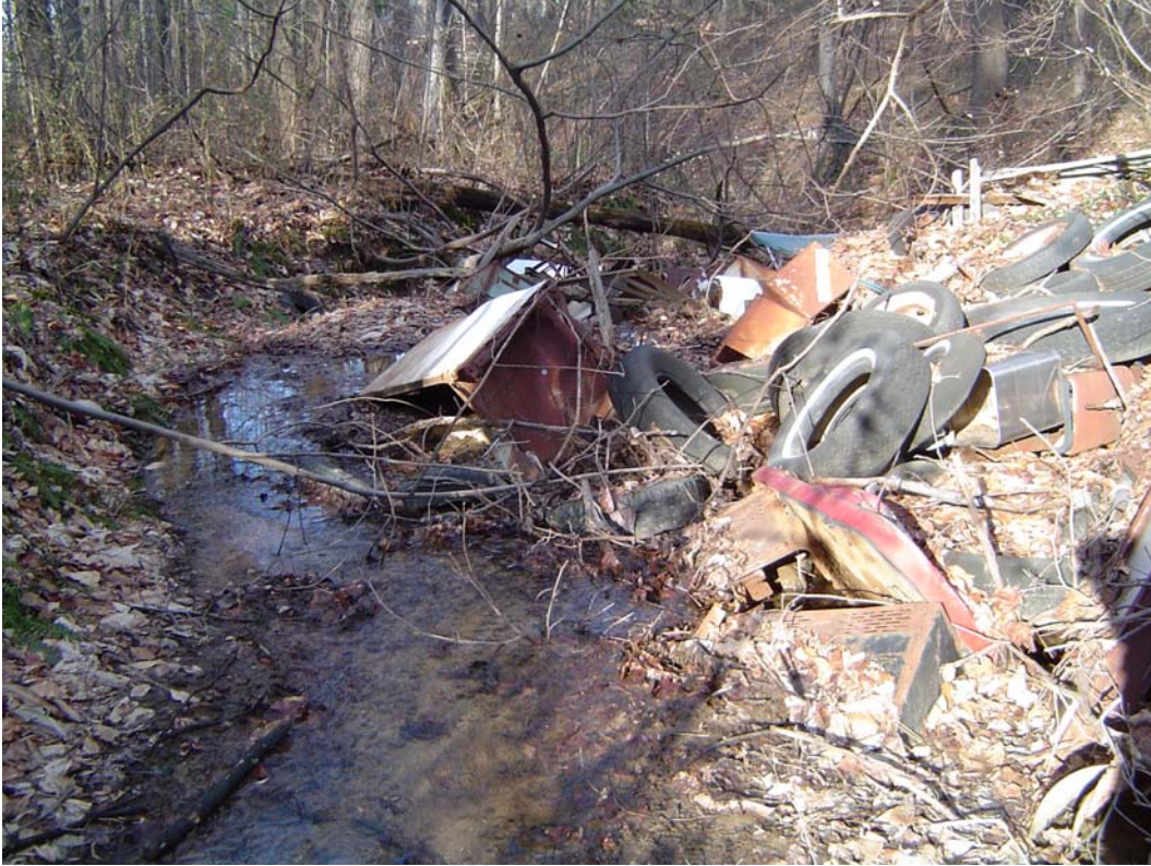
Watts Branch Headwaters