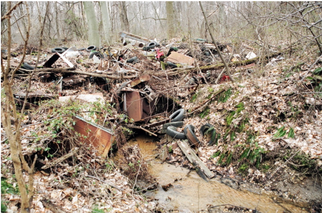
Watts Branch Headwaters (May 2005)