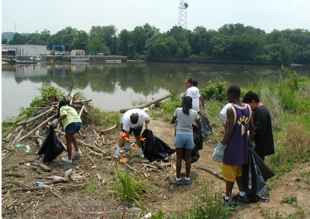
Colmar, MD Shoreline Cleanup