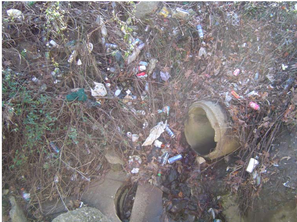
Trash on Stream Bank Near Capitol Heights Liquor Store