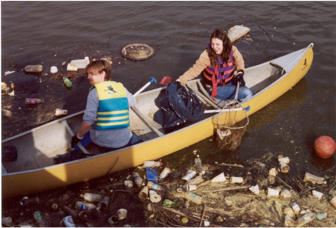
Canoe In Trash