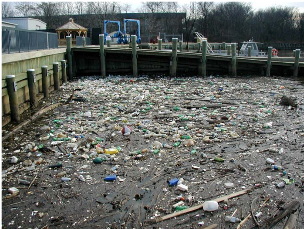
Wide Angle Toward Compound