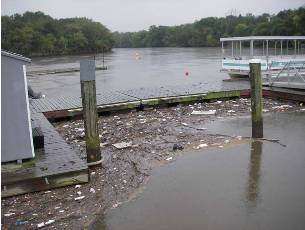
Trash Buildup