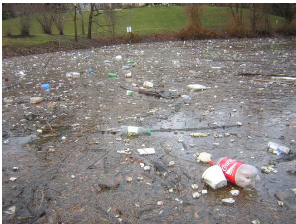
Captured Litter During Light Rain on February 4, 2006 (Sligo Creek)