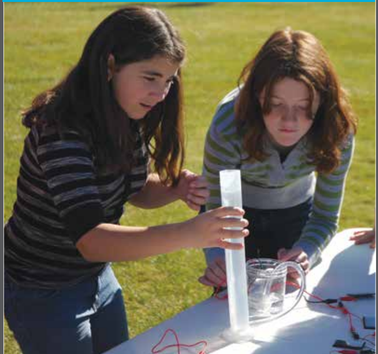
Students engaged in an engineering challenge.