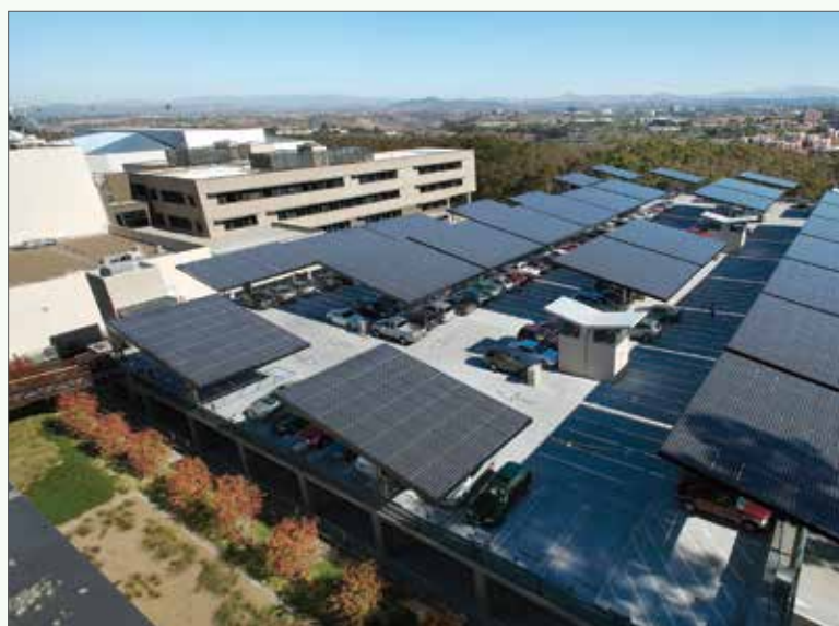
Solar trees on Hopkins parking structure, UC San Diego, San Diego, CA.

For arenas with parking garages or unshaded parking lots, carport-like installations may be a viable location option. While the racking structures that cover parking spaces will add to the cost of the installation, they may provide other benefits, such as shaded parking for cars and a reduction in the urban heat island effect created by large asphalt lots. Such installations are also highly visible, which is advantageous in creating an educational tool, raising awareness in the community, and as a tangible symbol of environmental commitment. Additionally, as electric plug-in vehicles become more prevalent, it would be possible to incorporate charging stations into these arrays.