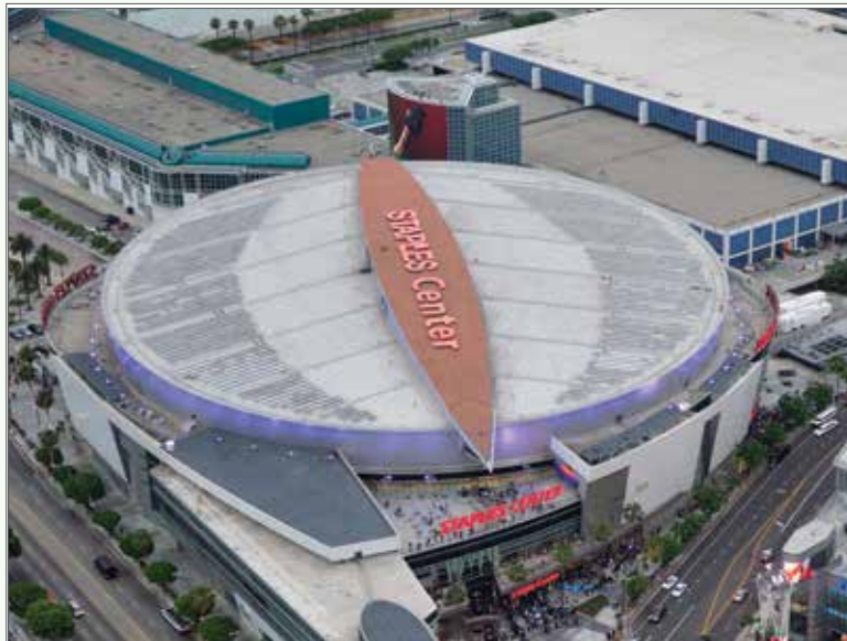
Arena roof system on the Staples Center, Los Angeles, California.

One potential installation location is the roof of your facility. This location has the advantage of requiring minimal racking structures to hold the solar panels, which may cut down on the cost of the array. Barring the existence of taller buildings in the immediate vicinity, there is less of a chance that roof solar panels will be shaded. However, some facilities may not have roofs with the load-bearing capacity necessary to support the additional weight of a PV array. As an example, a 3.25' by 5.5' SolarWorld Monocrystalline solar module with a DC rating of 250 watts weighs 46.7 lbs (or roughly 2.6 lbs/sq. ft.), not including the racks or other structures required to hold them.