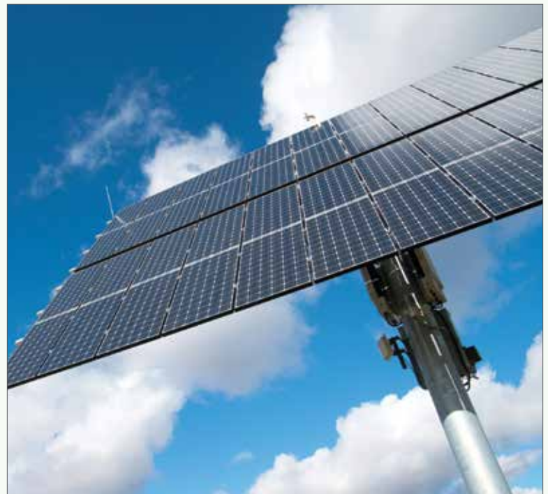
Pole mounted system.