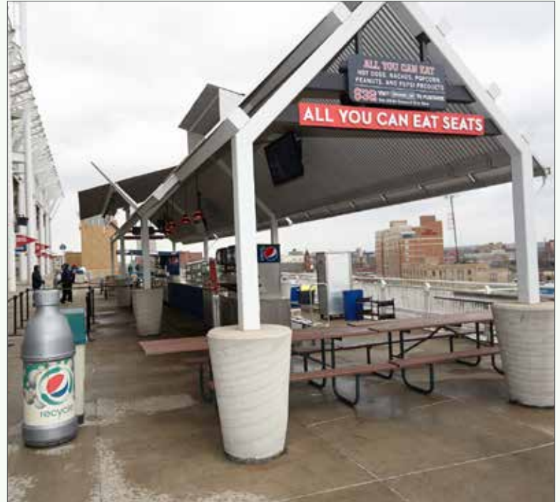
Canopy mounted system over a pavilion on the upper deck of Progressive Field.

If a rooftop installation is not viable, and a parking structure or canopy-mounted installation is either not feasible or not desirable, a pole-mounted array is another design option. A tracking device can be integrated into a pole-mounted system so that the solar modules follow the sun, increasing the array's output. This is a highly visible and space-efficient option, ideally suited for a demonstration or educational installation, and could be placed in almost any location that does not get shade.