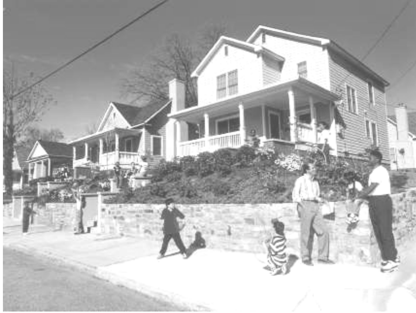
Martin Luther King Historic District, Atlanta.