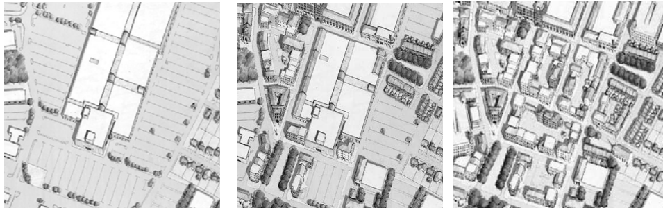
Infill development at the Eastgate Mall, Chattanooga.