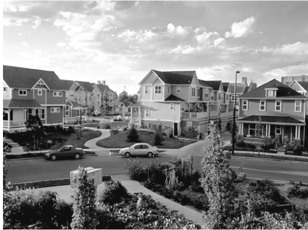
Highlands' Garden Village, Denver.

The system also incorporates a number of possible measures in the category of “community context and site design”: