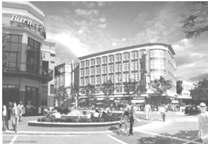
Bethesda Row, Maryland.

density, though more of them speak to residential density than to commercial density. Some systems also provide criteria relating to cultural resources or design affecting community features. Some also reward good on-site transportation features (i.e., beyond transit proximity), such as sidewalks and street connectivity.