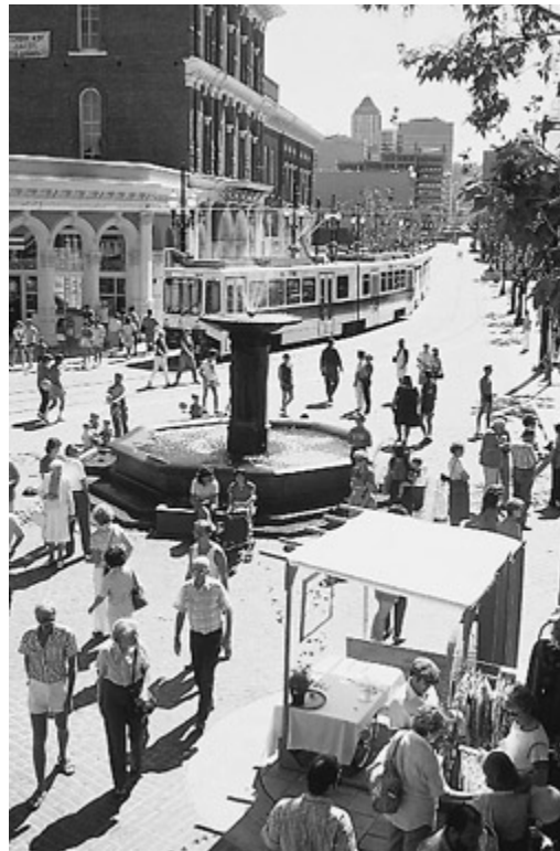
Public square and transit stop in Portland.