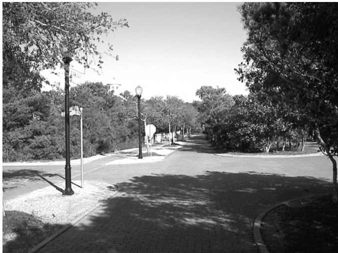
Porous pavement at Seaside.