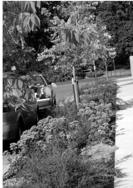
Native vegetation that never needs to be watered.