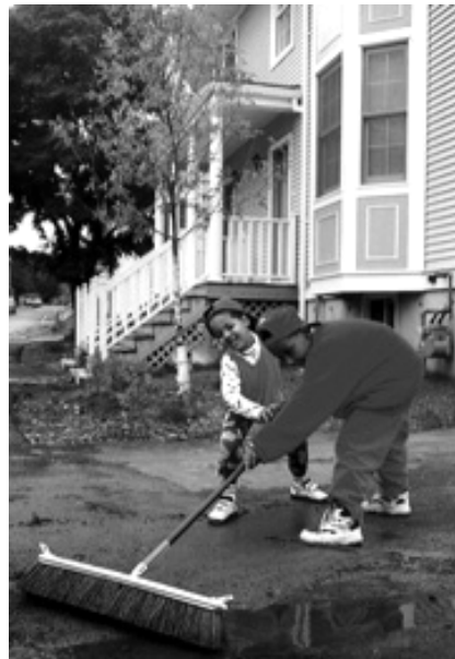
Dudley Street, Boston.