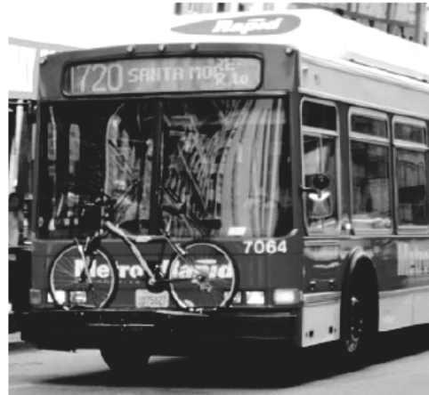
Smart transportation in Los Angeles.

In order to meet these requirements, developments should survey future occupants to identify transportation needs. Commercial buildings should be sited near amenities such as bike racks and public transit stations. Commercial buildings should share facilities such as parking lots.