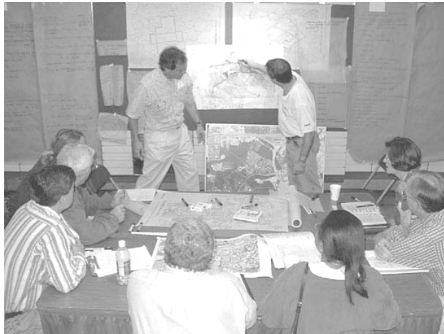
Public participation in the planning process.