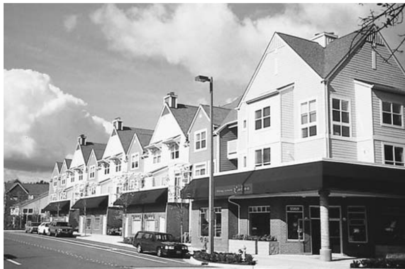
Corner store mixed with affordable housing.

Most rating systems establish diversity of uses within a project as a desirable component, and one on which developments should be evaluated. Few of them back that up with much specificity, however. Moreover, it must be noted that, for the purposes of LEED-ND, we may not want to require that a development have