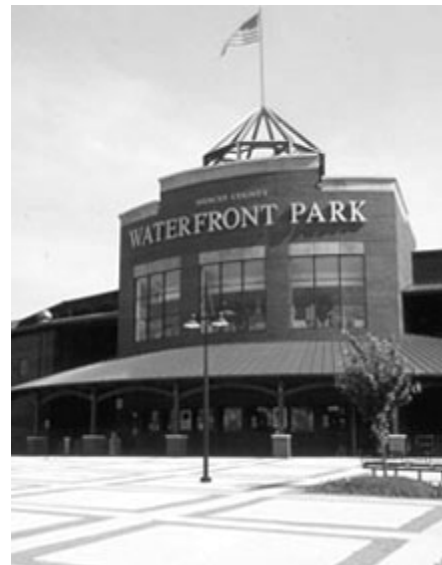
Waterfront Park on former brownfield in Trenton, New Jersey.

The proposal defines “brownfield” by reference to state law. NRDC’s Model Smart Growth Tax Credit, based on the New Jersey proposal, defines “brownfield site” as “any former or current commercial or industrial site that is currently vacant or underutilized and on which there has been, or there is suspected to have been, a discharge of a hazardous substance, a hazardous waste, or a pollutant.”