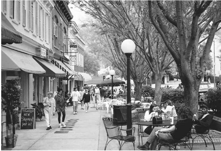
Downtown Athens, Georgia.

Some systems go well beyond factors tied directly to the pollution or resource conservation issues that we normally think of as “environmental” and also create incentives for design that respects or furthers issues of culture and community character. The most common of these are historic preservation and design that helps foster, for lack of a better phrase, “sense of place.” It is not clear to what extent we may want LEED-ND to address these issues, but we include them here for the committee’s consideration.