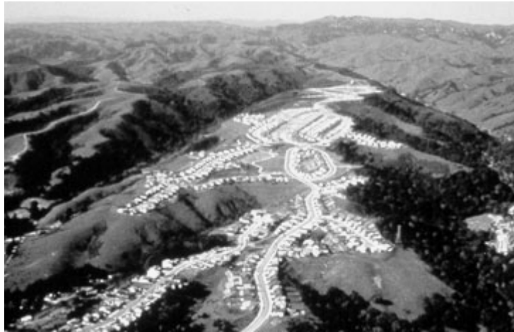
Mountaintop sprawl in California.