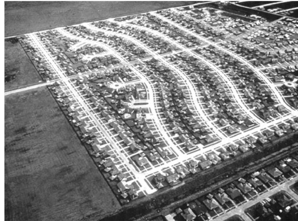
Roads to nowhere.

In addition to a project's location with regard to transportation infrastructure, several systems include criteria relating to on-site characteristics within a development such as street design, parking, and pedestrian and bicycle accessibility. On this subject, the existing systems provide a very rich and detailed menu of measures and standards.