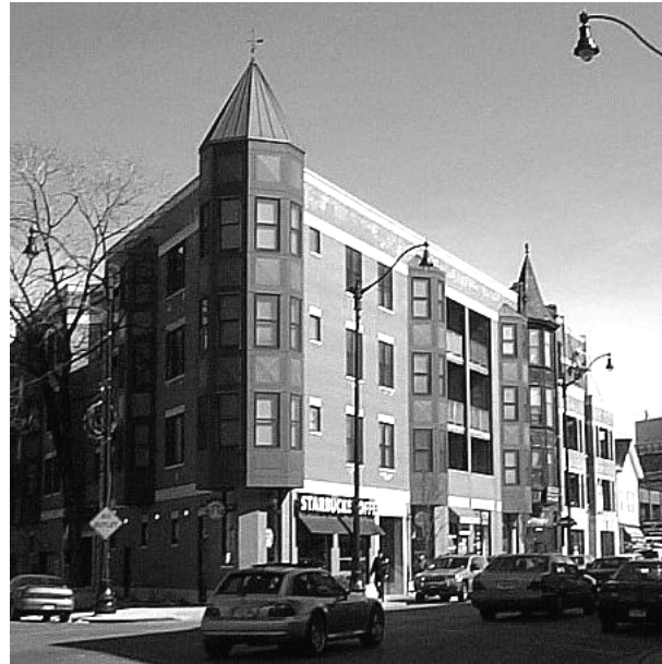
Small infill development in Chicago places condominiums above stores.

The following are suggested to qualify a project as “preferred”: