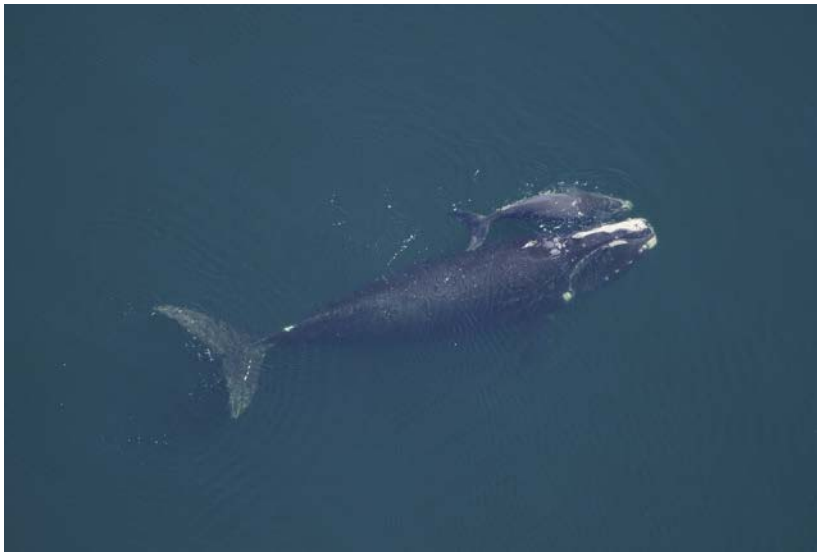
Image of a North Atlantic right whale mother and calf

67. NMFS has previously stated that North Atlantic right whales are in such a precarious condition that "the death or survival of one or two individual animals is sufficient to