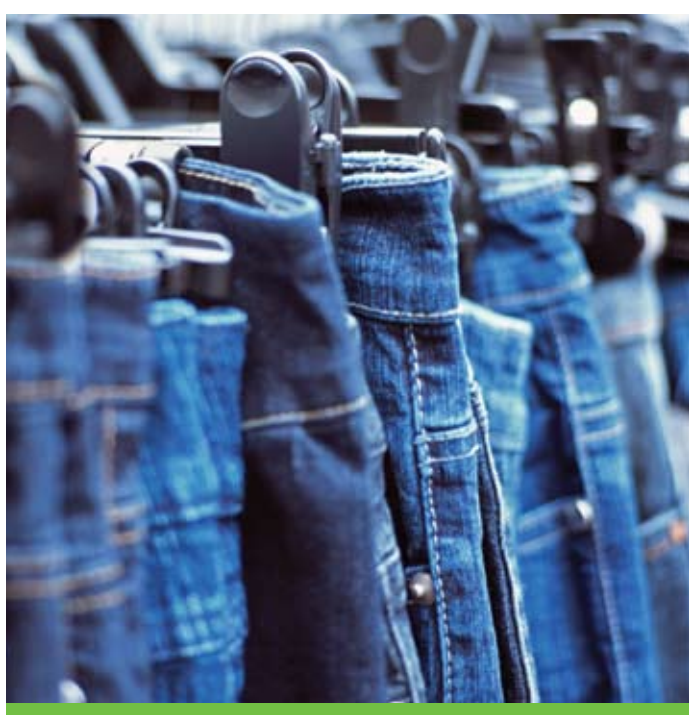
NRDC is tackling pollution threats here and abroad with a multifaceted strategy that uses first-rate science, partnership with government and industry, and policy know-how to clean up the world's textile industry.

Addressing the global health threats posed by the textile industry is a daunting challenge, even with more than 30