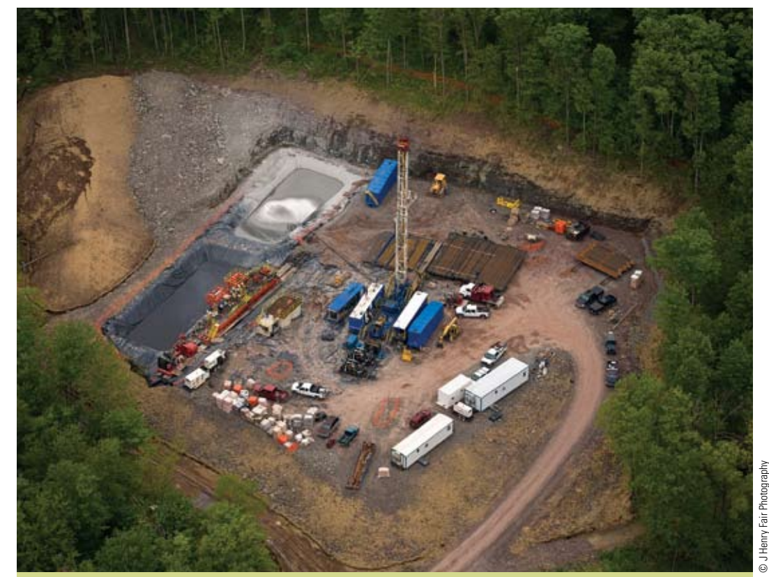
Drilling of the Marcellus Shale has already begun in nearby Dimock Township, Pennsylvania, and so have the first reports of dangerous spills. In September 2009, three spills of hydraulic fracturing fluid totaling more than 8,000 gallons polluted local wetlands and a creek, causing a fish kill.