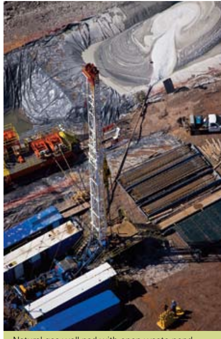
Natural gas well pad with open waste pond

Gas drilling results in the generation of a byproduct referred to as "produced water." Removed from the ground in order to allow gas to flow, produced water may be contaminated through contact with the natural gas itself, fracking fluids, or even naturally occurring radioactive materials. Produced water and recovered "fracking" fluids, along with other drilling byproducts, must be treated either on- or off-site prior to disposal. The lack of adequate treatment facilities in New York State poses a serious problem. Moreover, storing contaminated liquids in holding ponds or other vessels prior to treatment is dangerous given the risk of seepage or overflow.