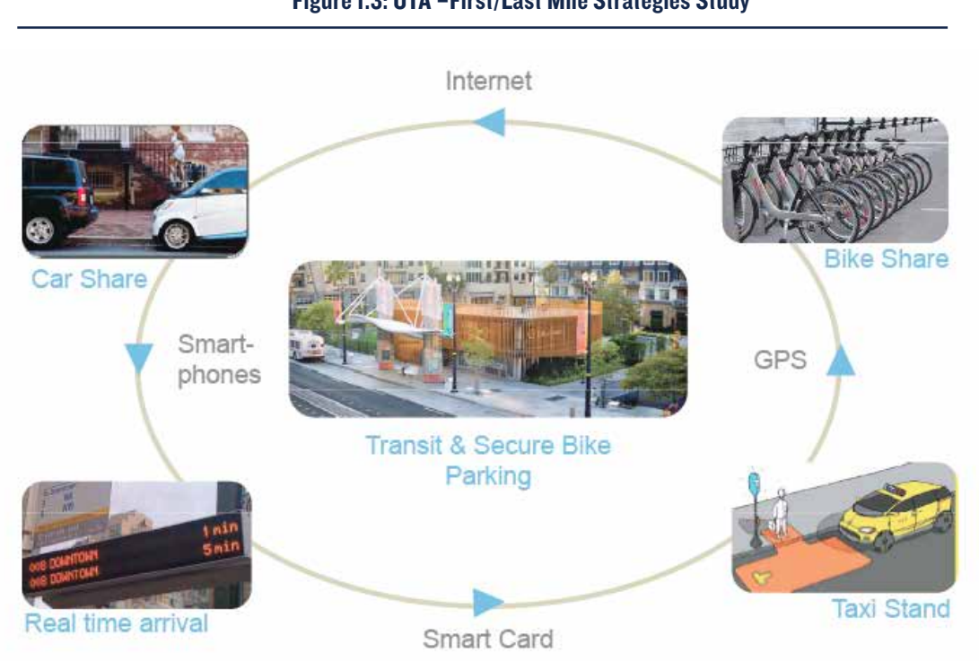
Figure 1.3: UTA -First/Last Mile Strategies Study

The UTA's completion of the First and Last Mile Connections Strategies Study is a big step in the right direction. However, the strategies still need to be implemented. The UTA has created an action plan for FLMC strategy implementation by type, requiring a high level of collaboration between the "lead agency/ies" and "supporting partners." The following table exemplifies the UTA's coordinated effort with county, state, regional, and local jurisdiction partners.