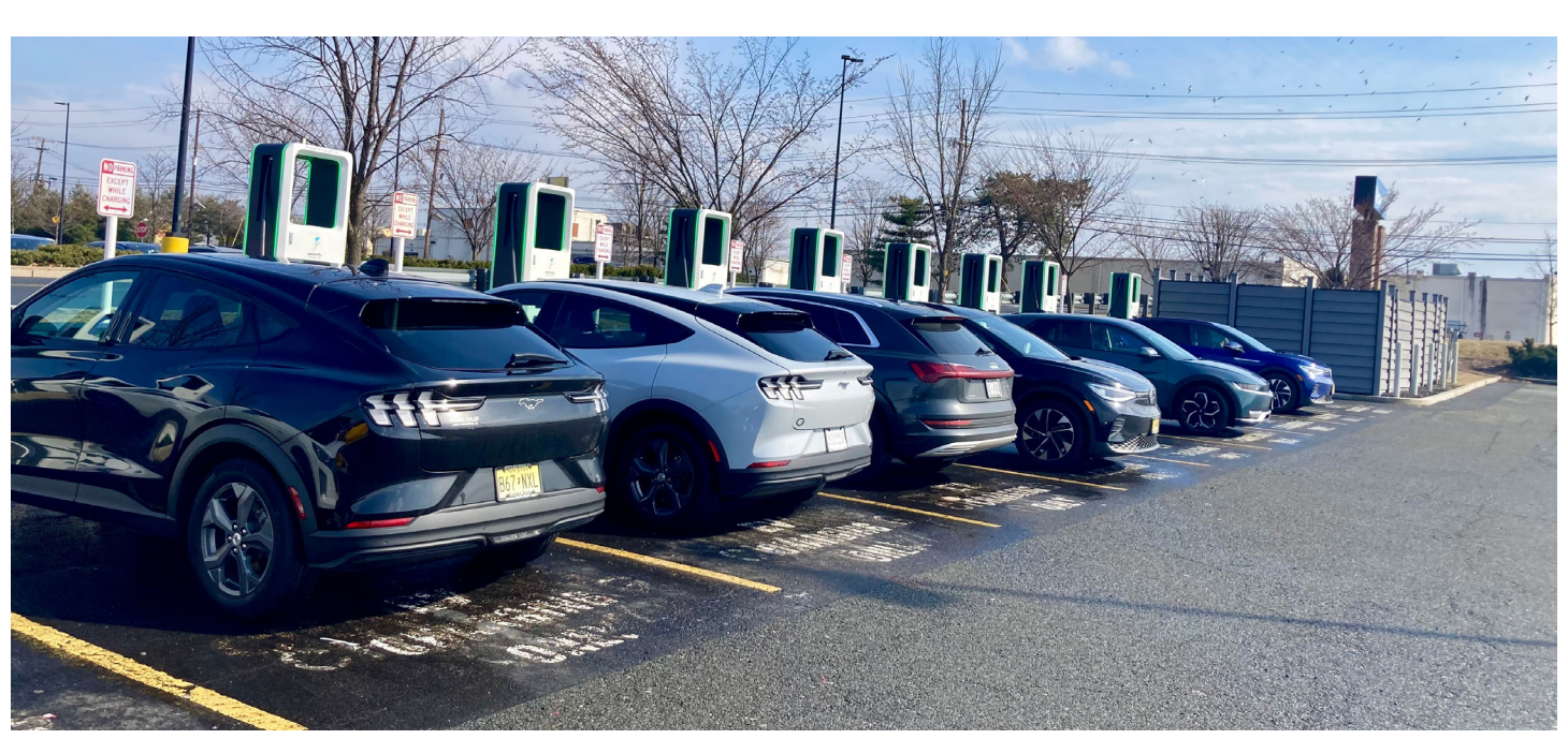
A line of electric vehicles using super charging stations at a Walmart in East Brunswick, New Jersey on March 6, 2022.

To help automakers in ACC II-compliant states reach their EV requirements, the regulations provide a handful of ways—known as "flexibilities"—for automakers to sell fewer EVs than nominally required and make up the gap. Among these flexibilities are "environmental justice vehicle values," which aim to enhance equity outcomes from the deployment of EVs. One pathway by which automakers can earn environmental justice vehicle values is by providing new EVs at a minimum 25 percent discount for exclusive service in community-based clean mobility programs.