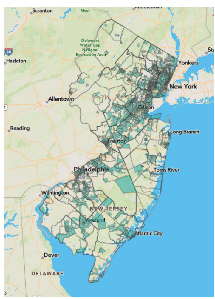
Figure 1: Map of Overburdened Communities