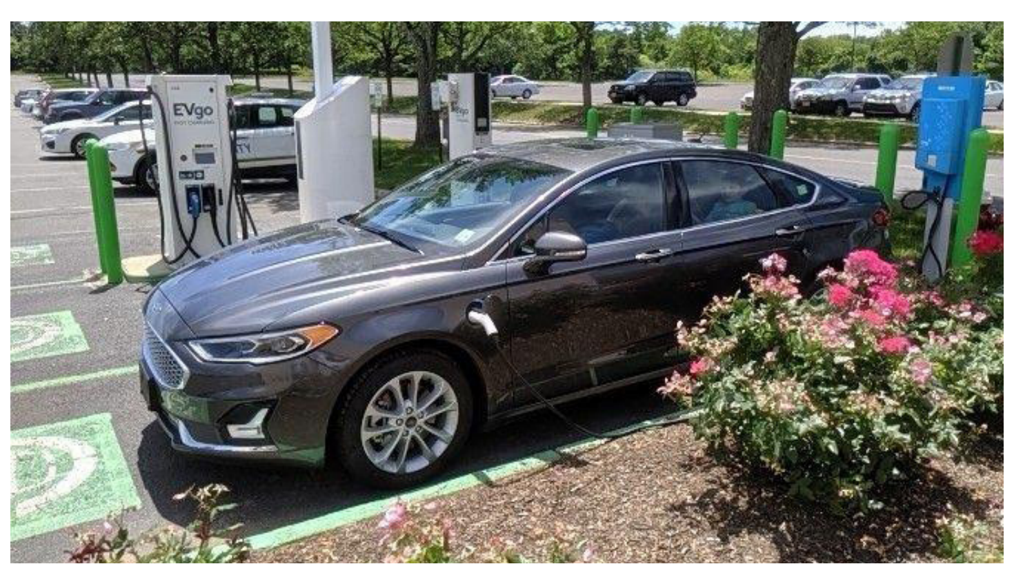
An electric vehicle at an EVgo charging station in the parking lot of Quaker Bridge Mall in Lawrence Township, NJ.