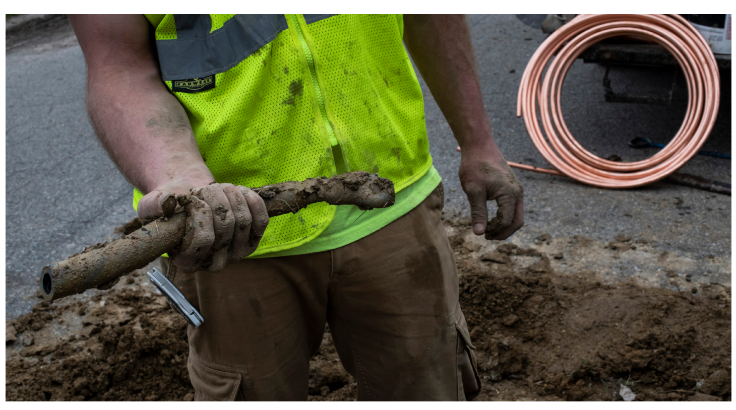
A piece of lead pipe removed during a service line replacement in Flint, Michigan.