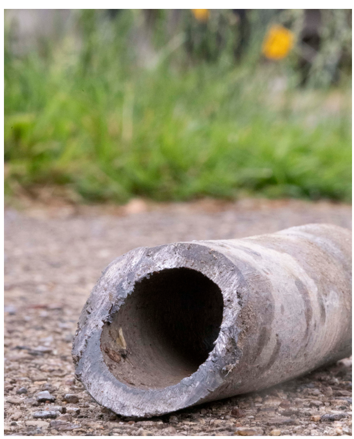
Part of a lead service line removed from outside a home in Chicago, Illinois.

The United States built drinking water infrastructure with lead pipes for well over a century, despite being aware of the health risks.<sup>1</sup> As early as 1893, for example, the Washington Post reported that experts were urging the local water utility to stop using lead pipes because of the health risks.<sup>2</sup> Yet cities across the country continued to use lead pipes for many decades at the urging of water utilities, local officials, and lead industry lobbyists.<sup>3</sup> Today scientists and health experts agree that there is no safe level of exposure to lead and that we should avoid such unnecessary exposures.<sup>4</sup>