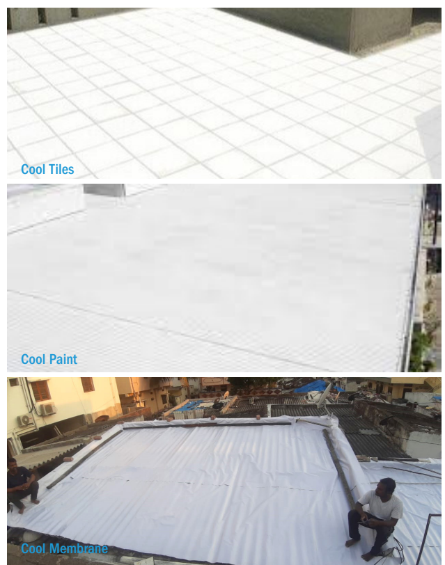
Figure 2: Types of Cool Roof Materials

Cool roofs are receiving increasing attention from India's policymakers as necessary components of a comprehensive national cooling strategy. In 2019, the Government of India released a national document titled the 'India Cooling Action Plan (ICAP),8 providing an integrated vision and strategy towards meeting the country's cooling needs across sectors over a twenty-year time horizon. Reducing cooling energy demand is key to implementing the ICAP. The plan proposes an approach that reduces the cooling energy demand through climate-appropriate and energyefficient building design and low-cost strategies such as cool roofs. Specifically, the ICAP recommends cool roof programs to provide thermal comfort for Economically Weaker Sections (EWS) and Low-Income Groups (LIG) through local Heat Wave Action Plans. Similarly, in India's National Mission on Sustainable Habitat<sup>9</sup> under the National Action Plan on Climate Change, cool roof techniques are recommended for all new constructions of more than 20,000 sq. m area in peri-urban areas.<sup>ii</sup>