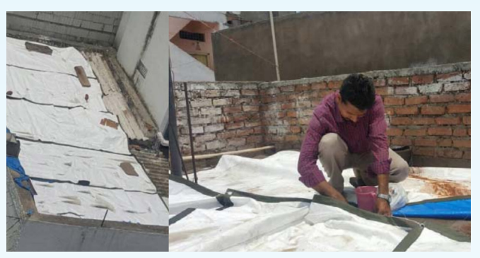
Figure 1: Cool Roof Pilot Installation Underway in Hyderabad on Low-Income Household Roof, 2017.

With less than 10% of India's households having air conditioning, millions more are expected to purchase air conditioners, leading to soaring demand for electricity.<sup>4</sup> At the same time, India has nearly half a billion people living in densely populated cities, with skyrocketing development that converts green open space into paved, heat-trapping roofs and roads. These hot surfaces worsen the urban heat island effect (UHI)<sup>i</sup>, driving temperatures even higher and ratcheting up the