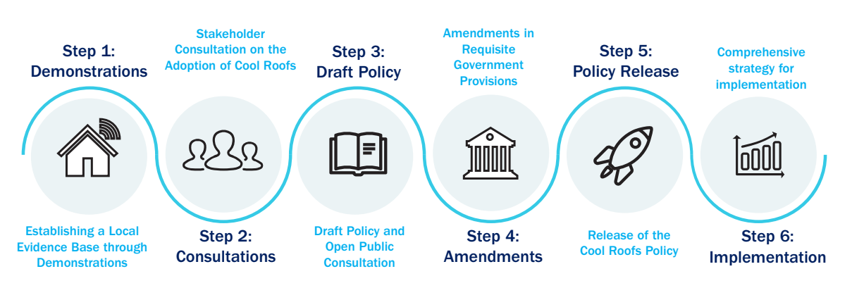
Figure 3: Steps for Development of State Cool Roofs Policy