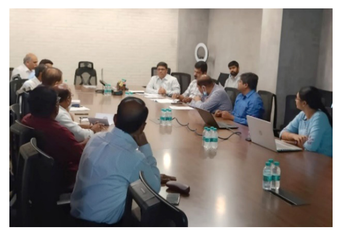
Figure 5: ASCI, NRDC and IIIT-H in discussion with state stakeholders on the implementation of cool roofs in Telangana, organized by GHMC

Technical discussions at these workshops delved into critical aspects of cool roof implementation and user needs, including the selection of appropriate roofing materials, installation techniques, and maintenance requirements. Additionally, energy efficiency, environmental impacts, and the financial aspects of cool roof installation were thoroughly examined. The policy was shaped and tailored to meet the specific needs of the community based on the stakeholders' input received in these technical discussions.