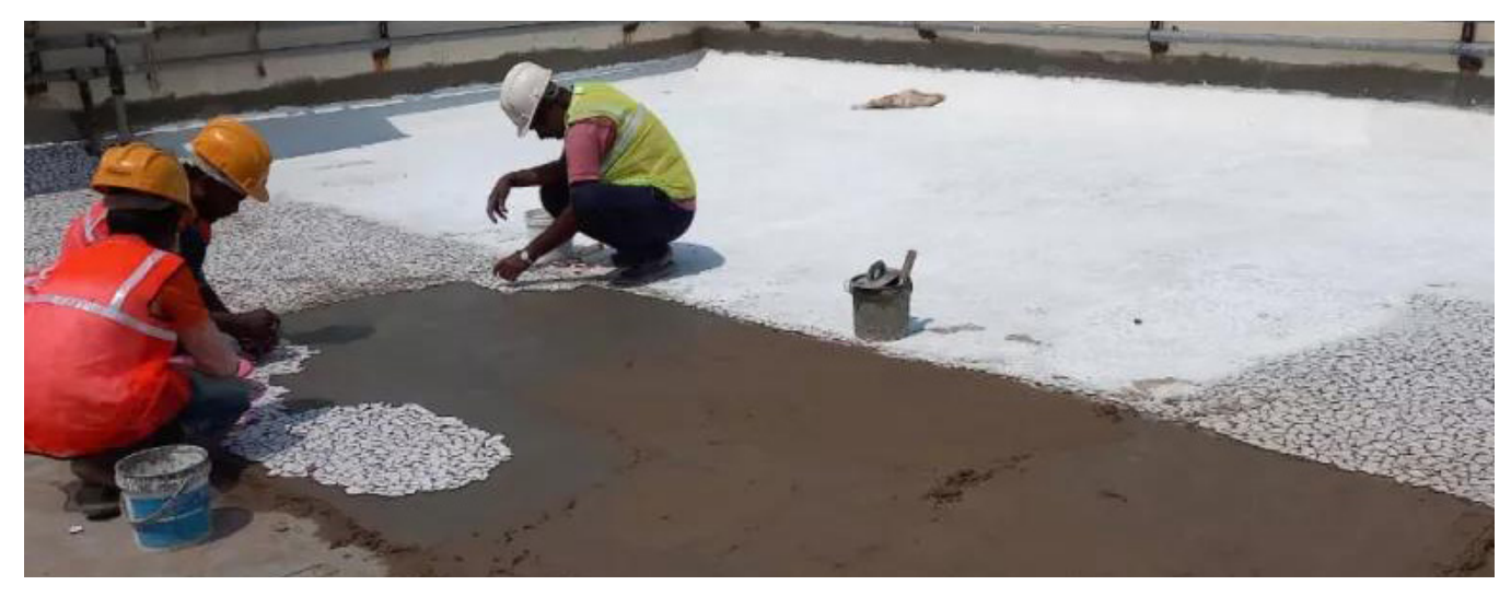
Figure 4: Mosaic Roof Installation in Kompally, Hyderabad, Telangana.

In addition to this pilot project, the project team conducted additional case studies, including cool roof monitoring at Garden Housing Society in Kompally, the application of cool roof coating with Nippon Hydroshield Damp Proof coating, and the installation