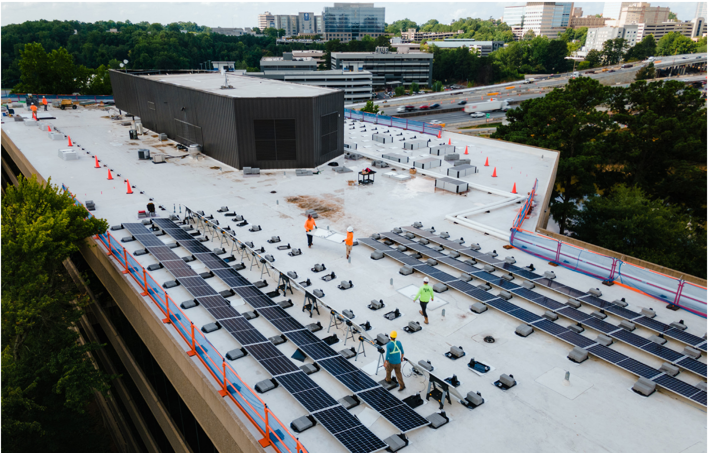
A rooftop solar panel installation by a Cherry Street Energy crew at the Palisades Office Park near Interstate 285 in Atlanta, Georgia.