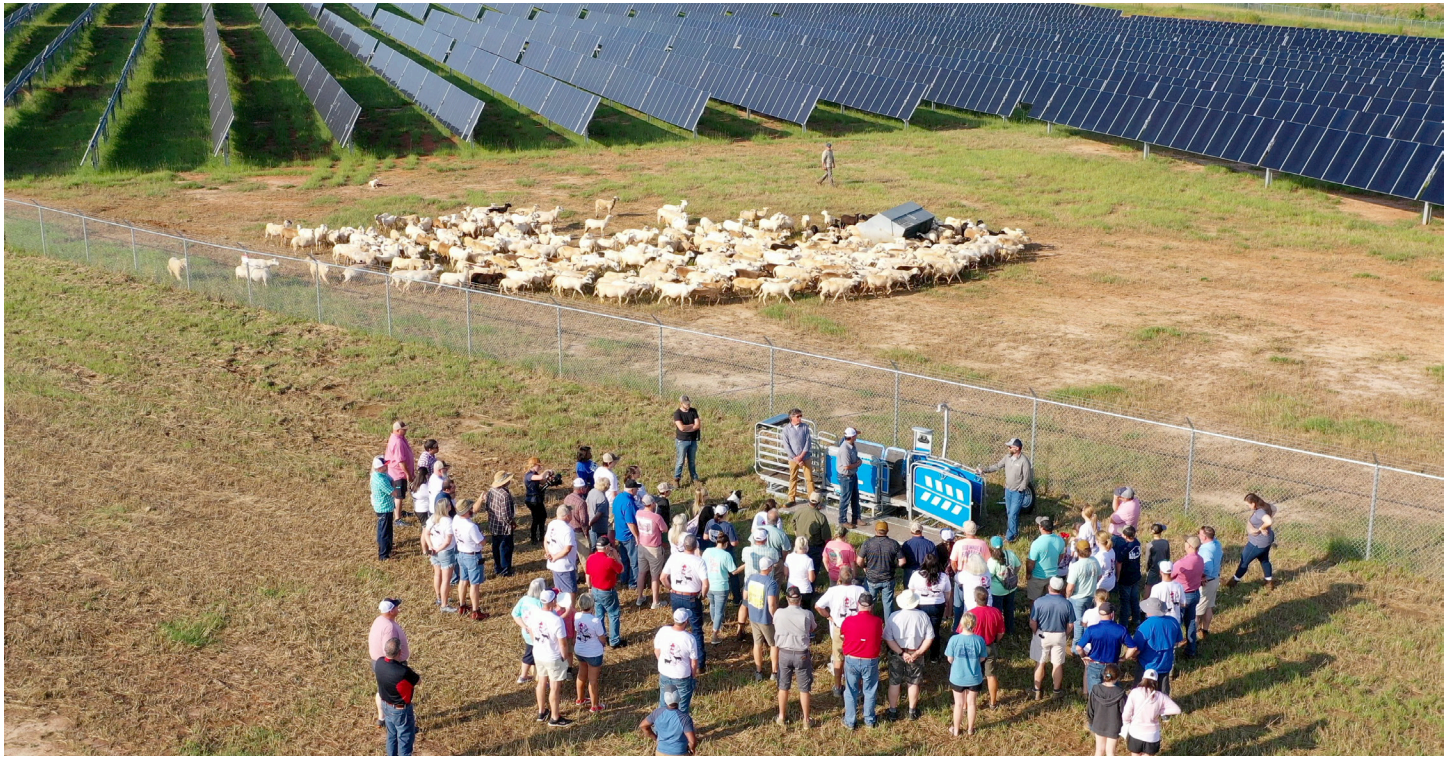
A group of farmers tour a community solar project that features dual-use photovoltaic technologies on a farm in Georgia.