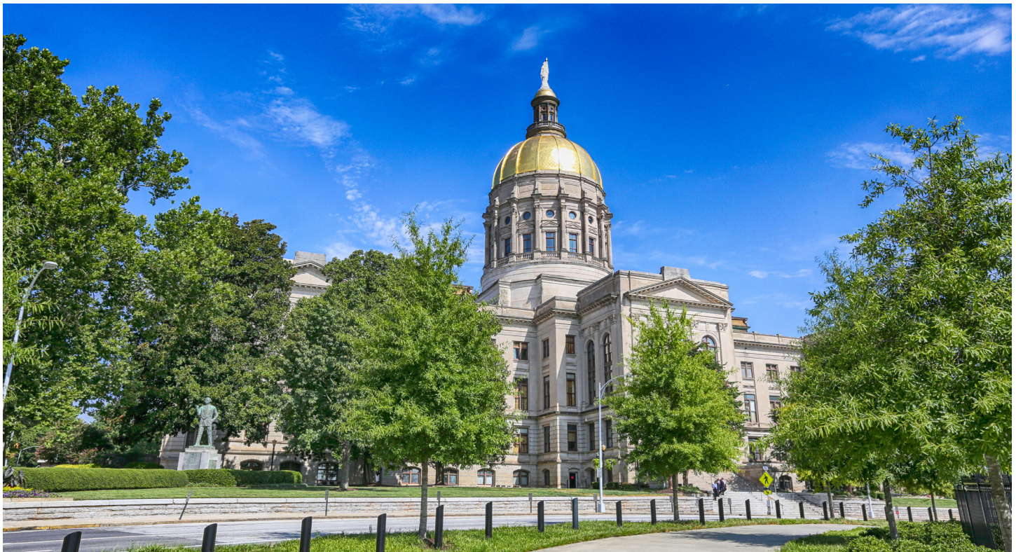
The state capitol building in Atlanta, Georgia.

Since then, however, there have been few legislative advances. The Georgia Homegrown Solar Act, introduced in 2023 but not yet enacted, is one example of a stalled initiative. 25 Administered by the Georgia PSC, the act would