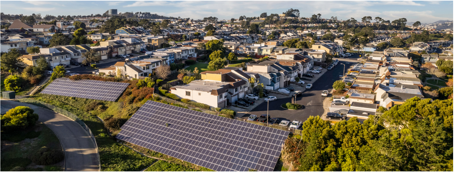
Solar arrays in a residential neighborhood of San Francisco, California.

However, the state’s current energy landscape is shaped and dominated by Georgia Power Company (GPC), whose policies are antagonistic toward residential and community solar. And at the legislative level, Georgia lacks something called “virtual net metering”—a key element of many successful community solar programs and those serving multi-unit dwellings—as well as meaningful incentives to support community solar development.