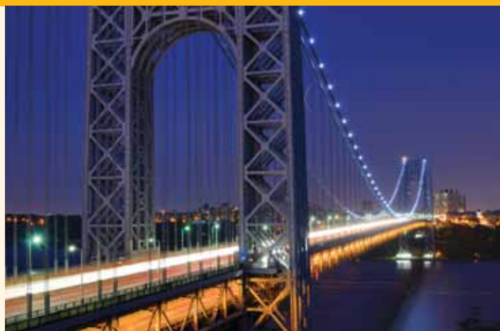
LSI Industries' LED lighting, featured here on New York's George Washington Bridge, creates good jobs in Ohio while saving money for municipalities and businesses.

LSI supports manufacturing plants in Cincinnati and Columbus in addition to its corporate headquarters. In Erlanger, Kentucky, just across the Ohio River from Cincinnati, its manufacturing plant employs 100 workers.