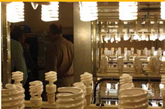
A TCP testing room, where CFLs undergo hours of rigorous testing before being released to market.

TCP also has a solution for those attached to the classic incandescent bulb's shape. The company manufactures bulbs that have old-fashioned shapes but new technologies, including LED, CFL, and incandescent bulbs that hark back to their classically-shaped cousins. There is tremendous demand for these "retro"-looking bulbs with advanced technology. TCP supplies big box retailers, including Home Depot, Lowes, Walmart, Sears, and many more.