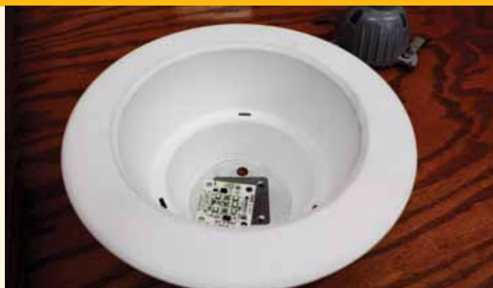
GrafTech's thermal management materials help dissipate heat inside LED lights.

While lighting is only one of its specialties—GrafTech's innovators also work on materials that enable technologies like smartphones and polysilicon manufacturing, and won a technical achievement Academy Award in 1956 for developing a flame yellow carbon process used in color photography—the company is one more manufacturer in Ohio that is spurring growth in the local clean energy economy. GrafTech has nearly doubled its workforce in Ohio over the past five years.