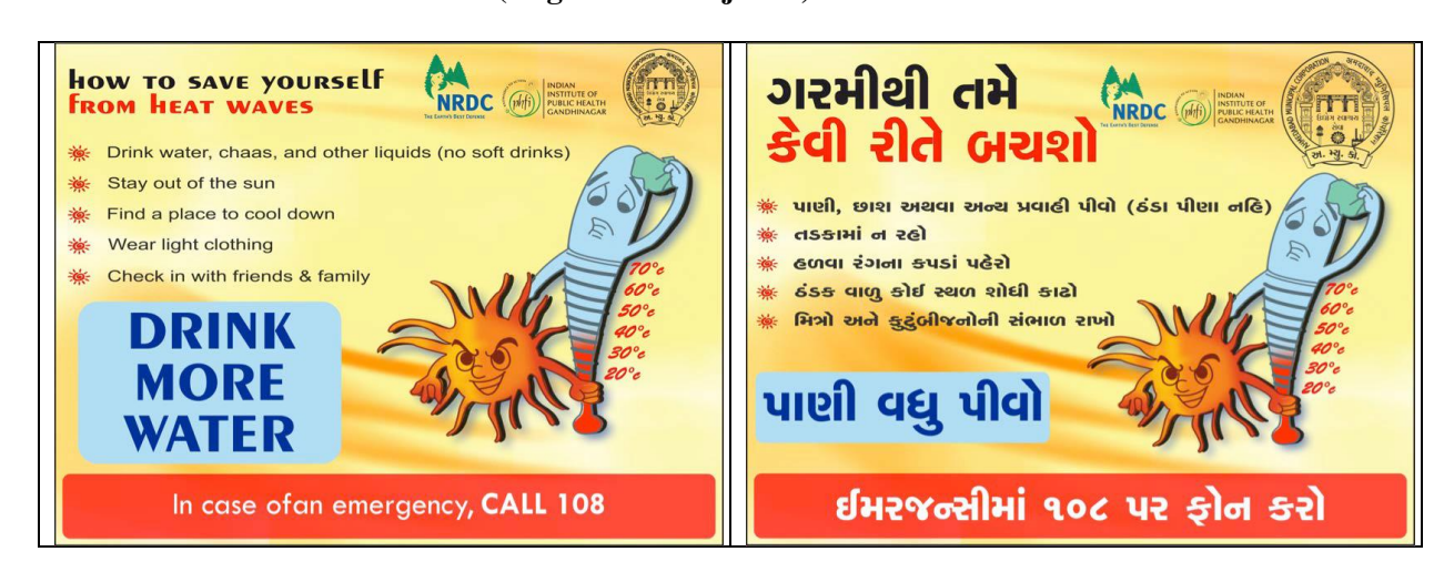
Heat Awareness Advertisement for Newspapers (English and Gujarati)