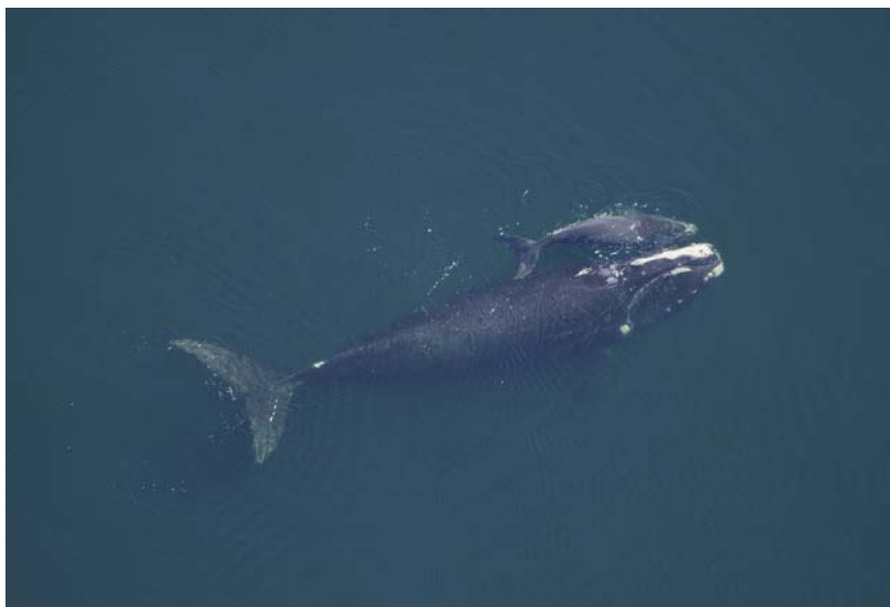
Image of a North Atlantic right whale mother and calf

66. Scientists estimate that approximately 400 North Atlantic right whales remain, with around 100 females capable of reproduction left in the population. Since April 2017, at least twenty right whale deaths have been reported, including at least nine females. In total, nearly 5 percent of the extant population is known to have died in the last two years. The world’s foremost right whale experts and NMFS’s own staff have publicly stated that the species is on the path towards extinction.