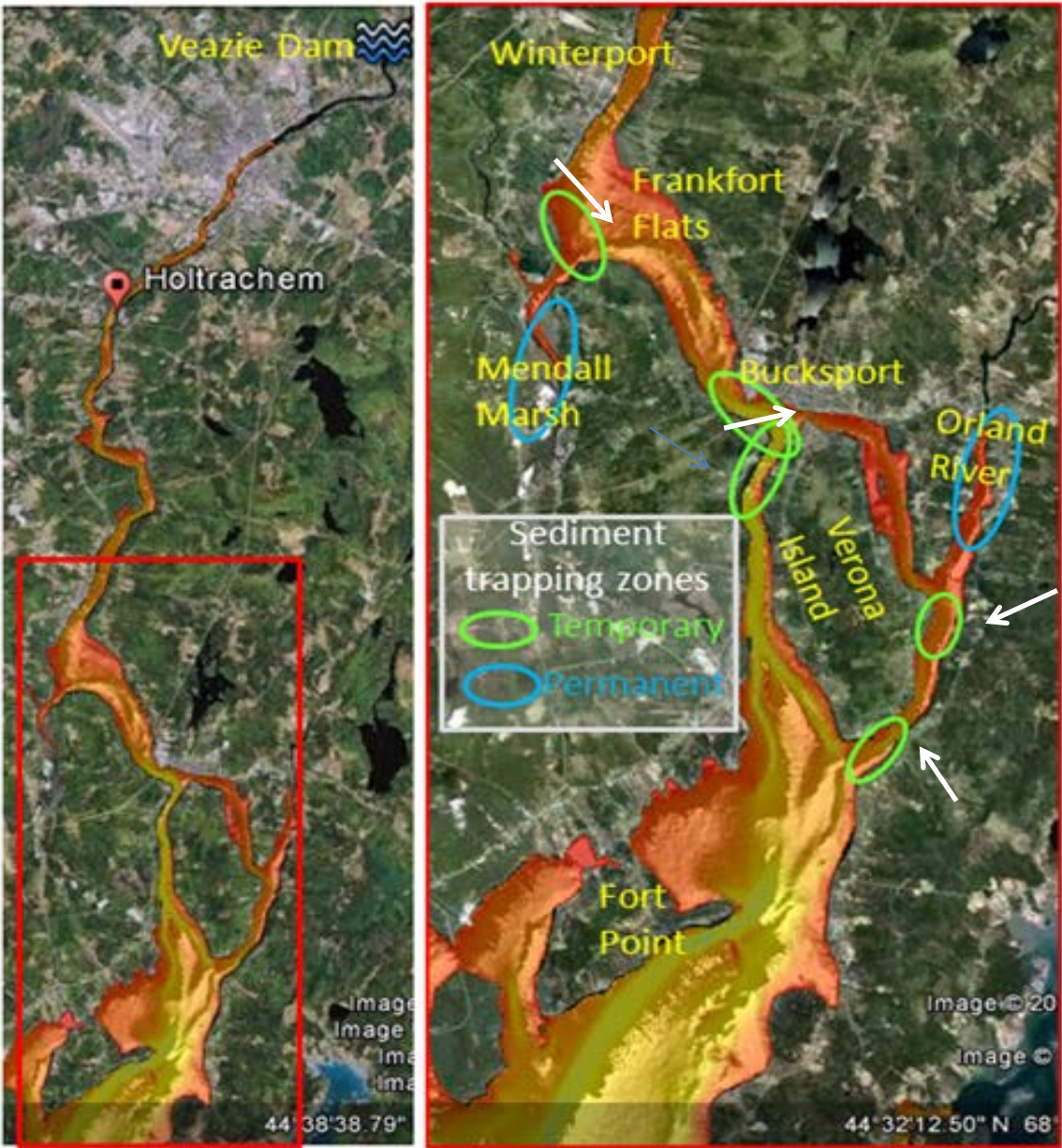
Figure 21-1. Map of temporary sites of mobile sediment deposition (light green ovals), and permanent sediment accumulations (blue ovals) sediment Chapter 7, and possible sites for trapping of mobile sediment, which would later be disposed of in CADs