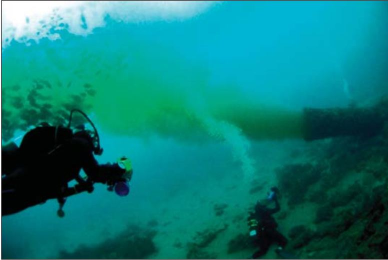
Image of the Delray, Florida, sewage outfall. The outfall is the subject of a challenge to the permit renewal application pending before the Florida Department of Environmental Regulation based on its proximity to a coral reef that is exhibiting signs of algal overabundance from too many nutrients. Coral reefs need clear, clean, nutrient free waters to thrive.