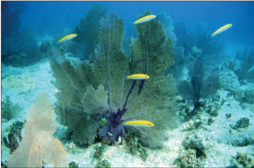
Healthy coral reef in the Key West, Florida, area. Coral reefs are one of the species that will be affected by global warming's impacts.

The National Wildlife Federation and the Florida Wildlife Federation looked at nine areas along Florida's coast (including Pensacola Bay, Apalachicola Bay, Tampa Bay, Charlotte Harbor, Ten Thousand Islands, Florida Bay, Biscayne Bay, St. Lucie Estuary, and Indian River Lagoon) to see how a moderate scenario of a 5- to 27-inch rise in average sea level during this century is likely to affect coastal habitats.