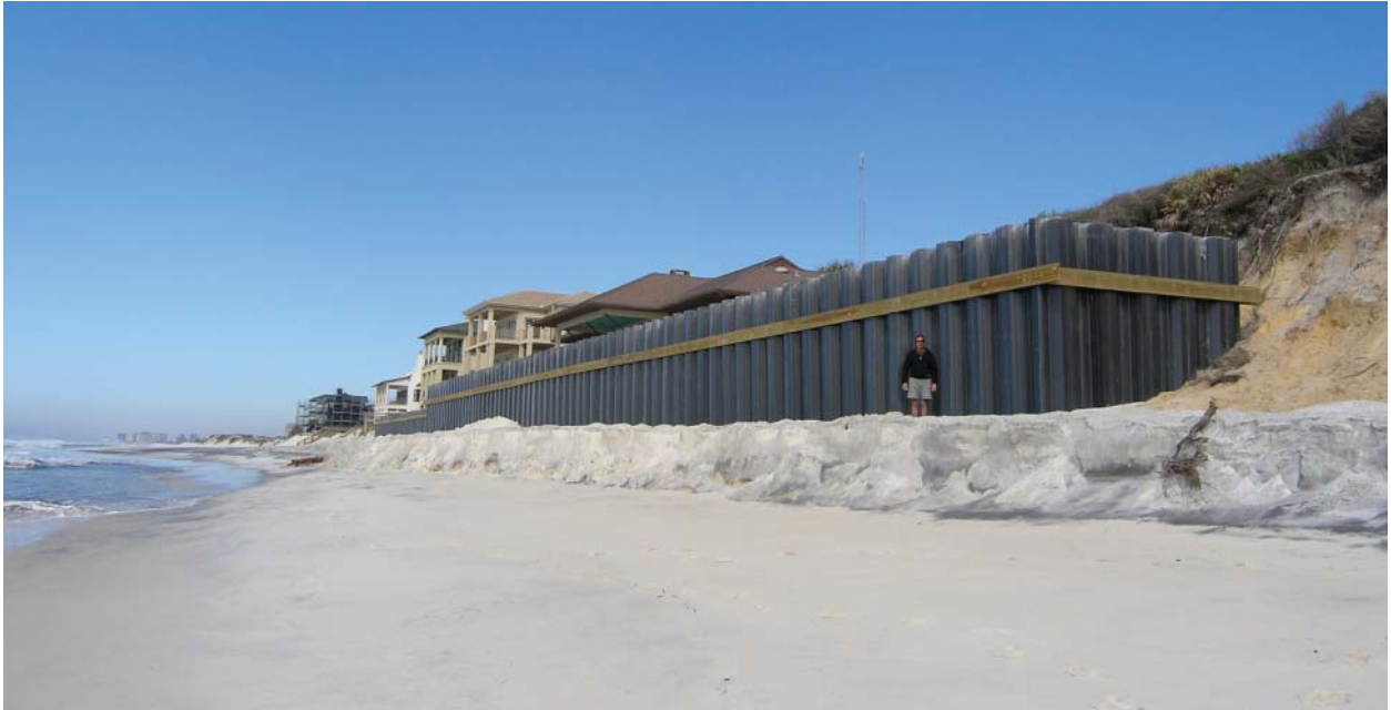
Hundreds of sea wall permits were issued in Walton County immediately after Hurricane Dennis. This unprecedented sea wall building frenzy may become more common as beaches continue to erode.

It has been 20 years since the Florida Legislature adopted the current coastal-protection policies, and many of the policies are outdated. The state needs to change how it subsidizes coastal development, including on barrier islands, to prevent environmentally damaging development. The first priority must be to protect key features, including dunes, mangroves, estuaries, and coral reefs. These natural habitats buffer storm surge and provide key habitat for economically important fish and wildlife.