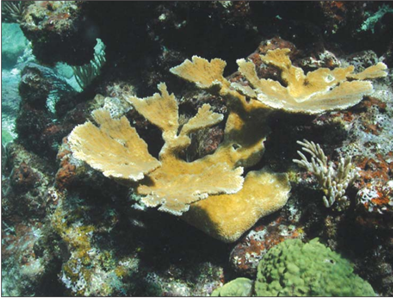
Elkhorn coral has recently been added to the U.S. Endangered Species List. This shallow branching coral has been decimated by white pox disease, caused by a common bacteria found in sewage.

mercury pollution a low priority. Other industrial contaminants have turned up in Florida fish: PCBs were found in high levels in mullet in Pensacola Bay, and high dioxin levels have been found in fish near paper mills. Florida's Department of Health responded by raising the dioxin threshold for fish consumption advisories from 1.2 parts per trillion to 7 parts per trillion. This allowed some advisories to be lifted and others to be avoided. 49 50 The state concedes it has little data for contaminants in many other species, due to limited funding for tests. Tests by the Mobile (Ala.) Register newspaper found methylmercury in several Gulf species, including redfish and amberjack, at levels so high that the U.S. Food and Drug Administration would prohibit selling them to the public. 51