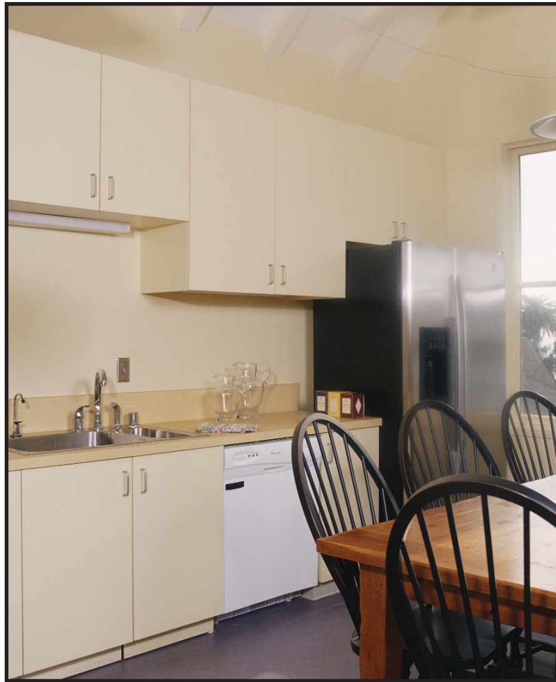
Tim Street Porter

The refrigerator, microwave, and range are manufactured by General Electric. The dishwasher, produced by Eurotech, utilizes approximately half as much water—five gallons—as compared to most U.S.-made dishwashers. All appliances carry the Energy Star rating, which means they exceed government energy efficiency standards by between 10 and 25 percent. Purchased from General Electric: www.geappliances.com and AM Appliance Group, Richardson, Texas: 972-644-8595; www.eurotechappliances.com .