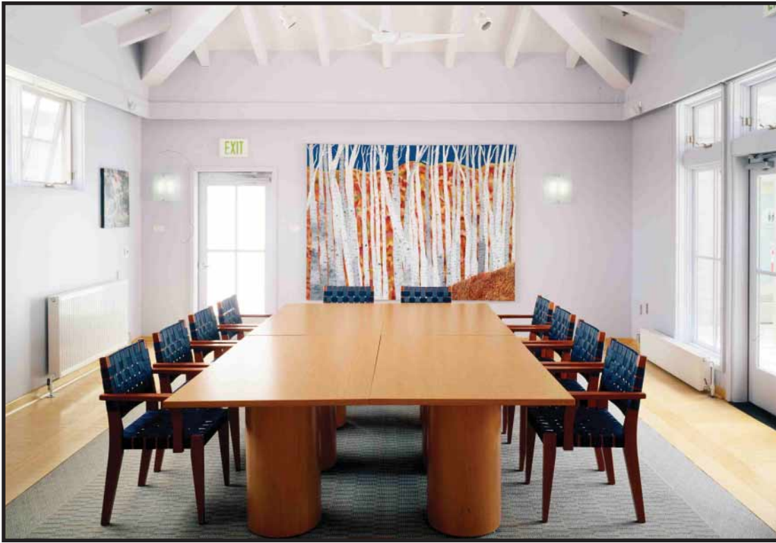
Tim Street Porter