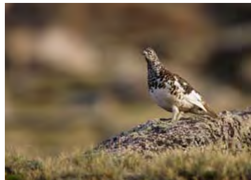
Warming of their alpine habitat has led to a decline of white-tailed ptarmigan in Rocky Mountain National Park.

This challenge can be met through improvements in building, vehicle, and industrial efficiency; increased investment in renewable energy and low carbon fuel; and deployment of technologies to capture and store carbon emissions. Enacting mandatory federal greenhouse gas limits will stimulate investment in cleaner energy technologies. Additionally, policies that reform perverse regulatory incentives and help overcome the significant barriers to investment in energy and transportation