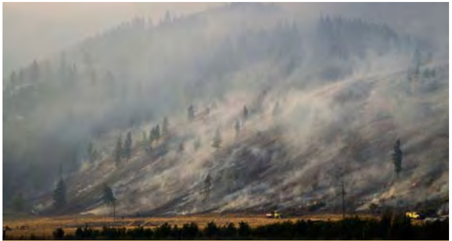
A forest fire smolders in Montana in 2007, part of an unusually severe fire season in the state.

The warming of the West is also disrupting the natural timing of seasons and leading to loss of wildlife . Species of wildlife are adapting to an altered climate by changing where they live—and in some cases are being eliminated from areas where they used to live. In Yosemite National Park, 14 of 50 studied animal species can no longer be found in lower-elevation portions of the range they occupied early in the 20th century.