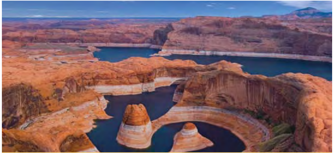
White "bathtub rings" show the pre-drought water level of Lake Powell in Arizona.