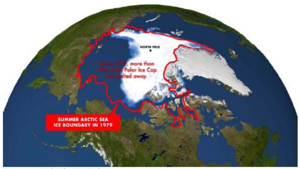
Figure 1. ARCTIC MELTDOWN – Arctic summer sea-ice extent in 1979 and 2007 (source: NASA)

Time is very short. Scientists warn that we will suffer devastating damages if we let global average temperatures rise by more than another 2 degrees Fahrenheit. A Union of Concerned Scientists (UCS) analysis has shown that to keep open a better-than-even chance of avoiding this greater-than-2°F temperature increase, global emissions need to be cut in half by 2050. While all major emitters must participate, the world's richest countries – with per capita and historical emissions far higher than developing nations and with the most technological and financial resources – must lead and must do the most. The U.S. and other developed nations need to start reducing emissions now and reduce them on the order of 80 percent by 2050.