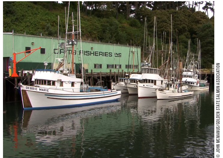
Fishing boats in Fort Bragg, California

In 2018, SWRCB proposed a comprehensive, enforceable framework to protect the Bay-Delta and its watershed. It included standards for water temperatures below upstream dams, restrictions on Delta water exports, operations to protect fish and wildlife and other measures. In contrast, the VA does not include any restrictions on the operations of the big water projects that control upstream dams and the huge pumps in the Delta, ignores some rivers entirely, lacks