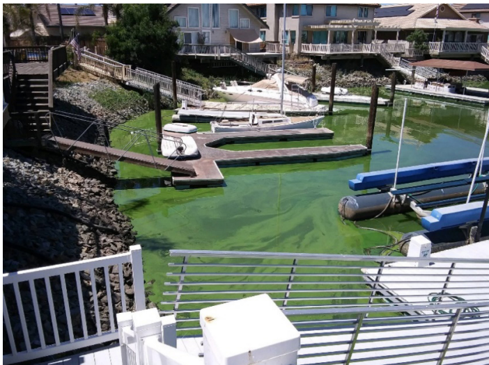
Harmful algal bloom, Stockton, California, August 2020

In violation of the requirements of state and federal law, SWRCB has not meaningfully updated and implemented water quality protections since 1995. This quarter century of inaction has driven many native fish and wildlife to the brink of extinction. The salmon fishery was completely closed in 2008 and 2009, resulting in devastating impacts to fishing jobs and communities. Increasing flows to the Bay is necessary to protect native fish and wildlife, thousands of fishing jobs and the families they support and water quality for farms and Delta communities. California can increase flows to protect the environment and sustain the economy through job-creating investments in local and regional water supply solutions like water recycling, improved water use efficiency on farms and in cities, and urban stormwater capture.