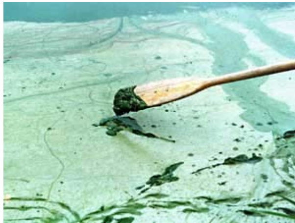
Figure 5. Blue-green algae.