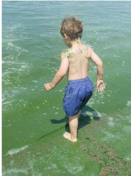
Figure 3. Boy swimming in blue-green algae, Lake Byllesby, Minnesota.

water rescue, military, construction, and maintenance personnel. 38 However, despite the health threats, resource management agencies often do not conduct any routine monitoring for blue-green algae or blue-green algal toxins. 39