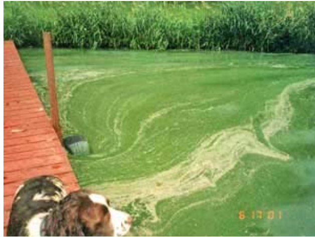
Figure 4. Dog near blue-green algae infested water.