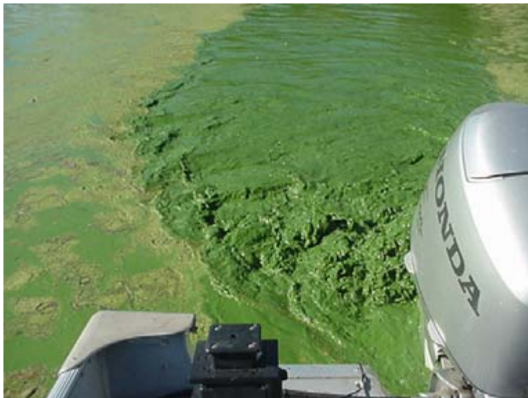
Figure 9. Algae, Wisconsin Department of Natural Resources.