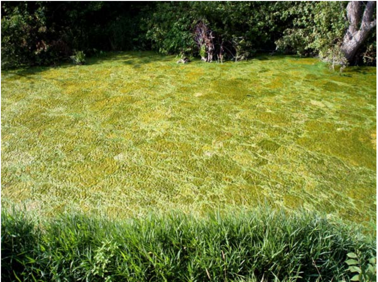
Figure 7. Algae Bloom (Minnesota Pollution Control Agency).

The following photos illustrate the aesthetic impact on waters within the Mississippi River Basin states: