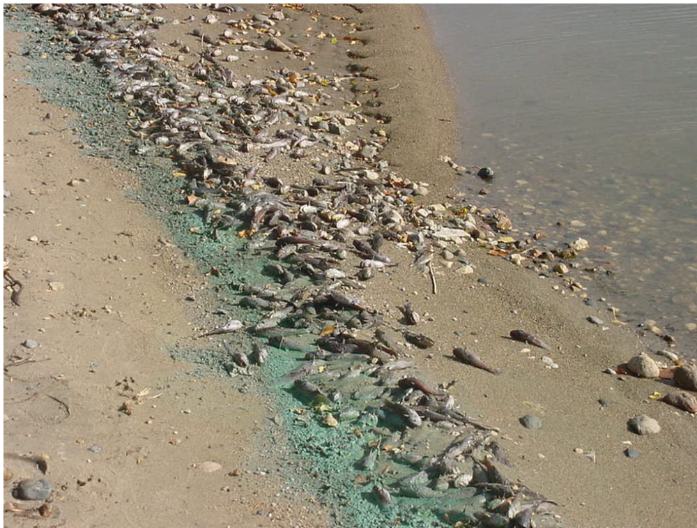
Figure 6. Photo of Lake Benton (Minnesota) Fish Kill, September 27, 2004.

A large fish kill on Lake Benton, in Lincoln County, Minnesota was caused by excessive algal growth. 81