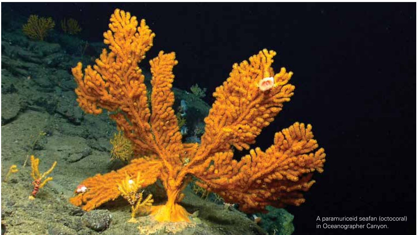
A paramuriceid seafan (octocoral) in Oceanographer Canyon.

Five undersea canyons off the southern New England coast and four nearby seamounts are home to a remarkable richness and diversity of ocean life. While their depth and isolation have kept these special ocean places largely pristine and free from human disturbance for millennia, the push to fish, drill, and mine in deeper and deeper waters will soon put these fragile habitats at risk. We must protect these deep sea treasures and avoid irreversible damage to remarkable ecosystems that we are still striving to understand.