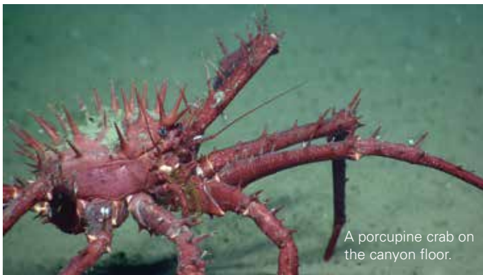
A porcupine crab on the canyon floor.