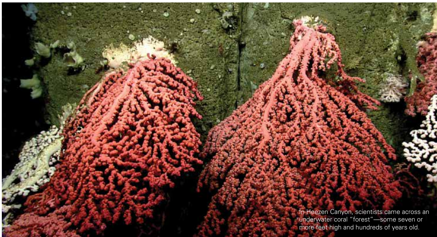
In Heezen Canyon, scientists came across an underwater coral "forest"—some seven or more feet high and hundreds of years old.