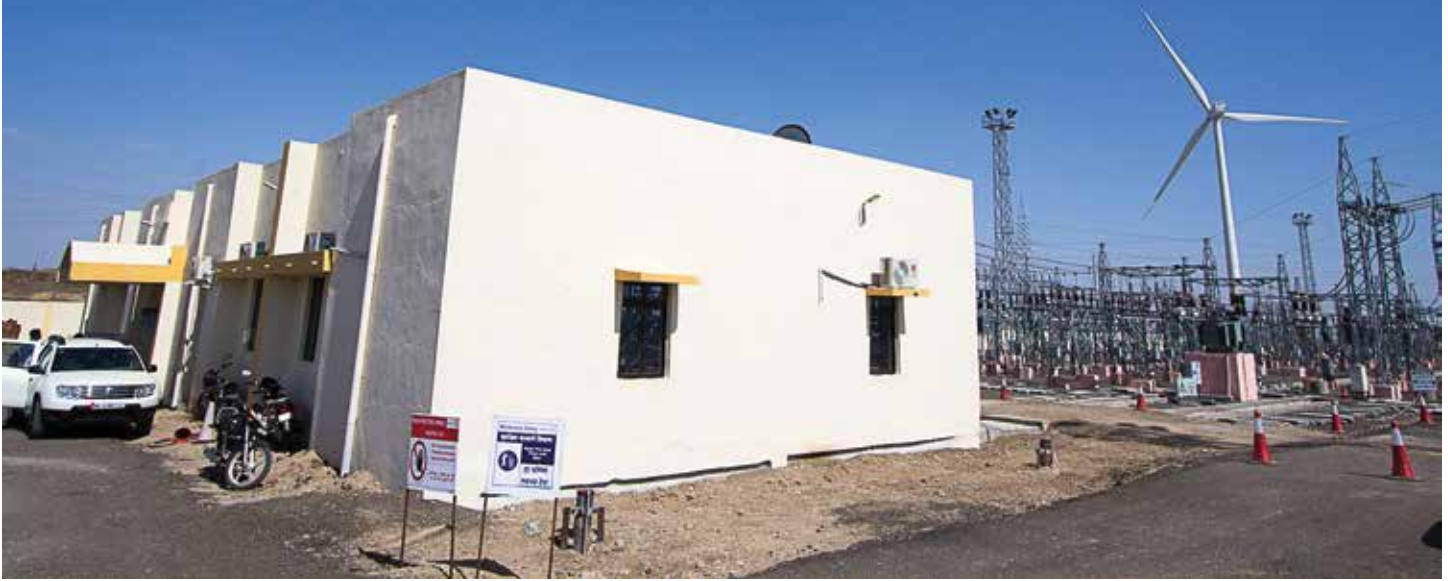
An Electricity Substation Dedicated to Wind Power in Jath, Maharashtra