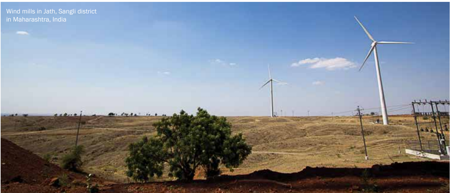
Wind mills in Jath, Sangli district in Maharashtra, India

Investments in the Indian wind market have fluctuated as have government policies. Financiers invested more than Rs 18,700 crore ($3.9 billion) in wind energy to add 3,200 MW