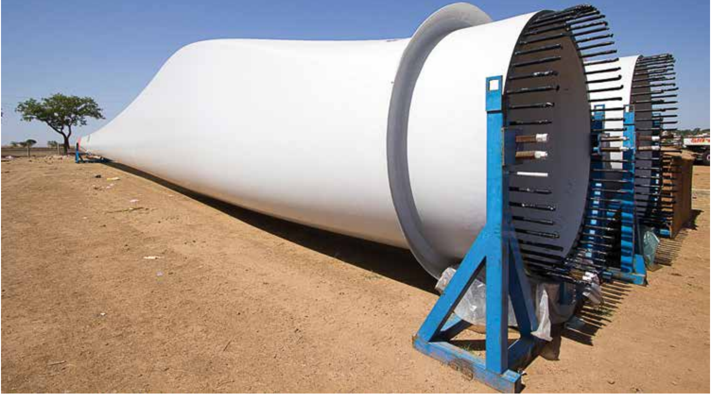
Wind Mill Blade Ready for Assembly on a Construction Site in Jath, Maharashtra

Another notable beneficiary of private equity investments was NSL Renewable Power, which raised $60 million through PE invested by Deutsche Investitions, FE Clean Energy Group, and IFC. 30 Bharat Light and Power raised Rs 200 crore ($37 million) from investors including UTI Capital, VenturEast, and Draper Fisher Jurvetson. 31 Morgan Stanley Infrastructure Partners invested $210 million in Continuum Wind Energy in 2012, one of the largest PE investments of that year. 32