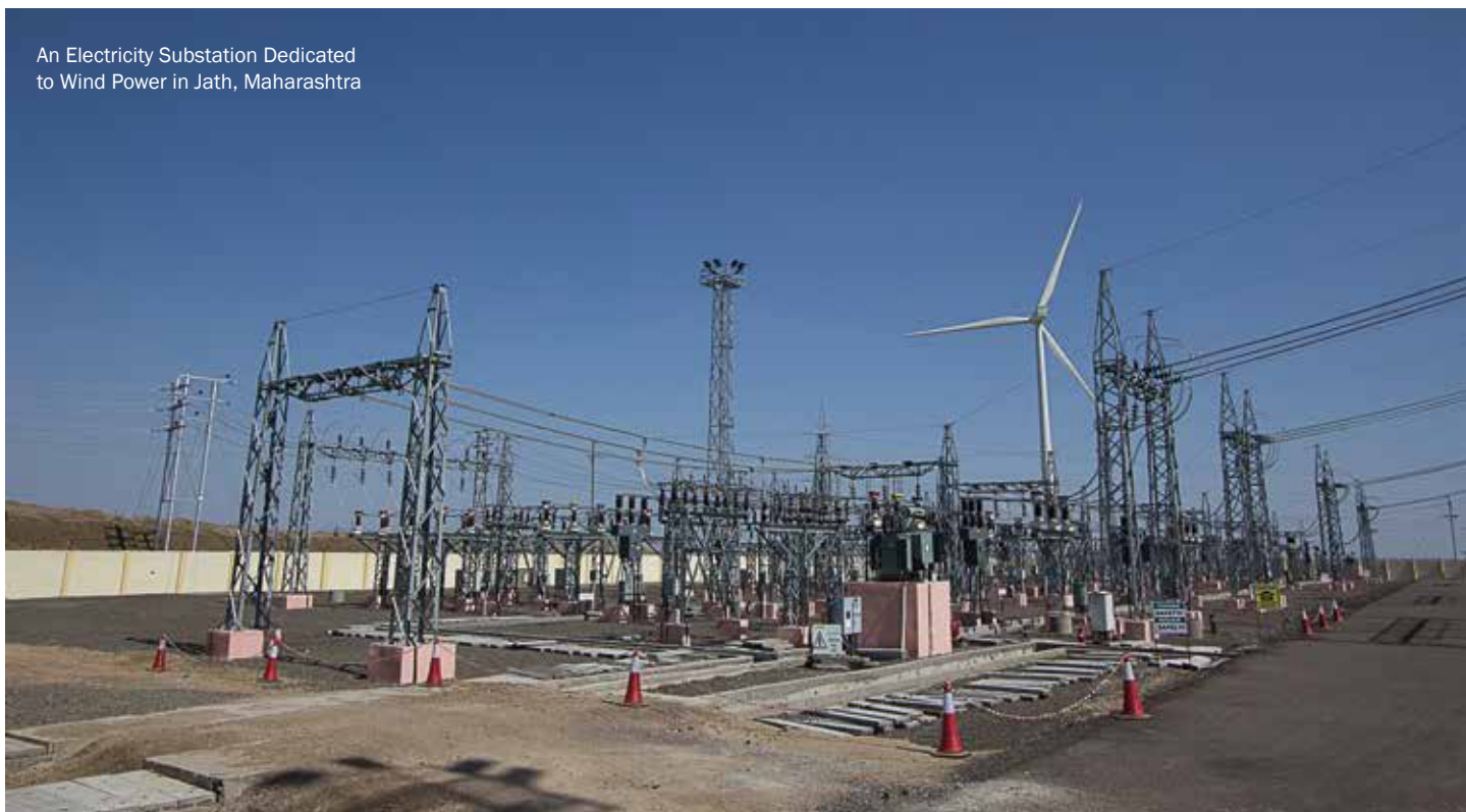
An Electricity Substation Dedicated to Wind Power in Jath, Maharashtra

The proposed National Wind Energy Mission (NWEM) could be ideal for addressing financing issues for wind and could turn India into a global leader in wind energy production. MNRE can also develop the Mission’s policy instruments with direct engagement with financiers, state governments, developers, civil society leaders, and among other key stakeholders.