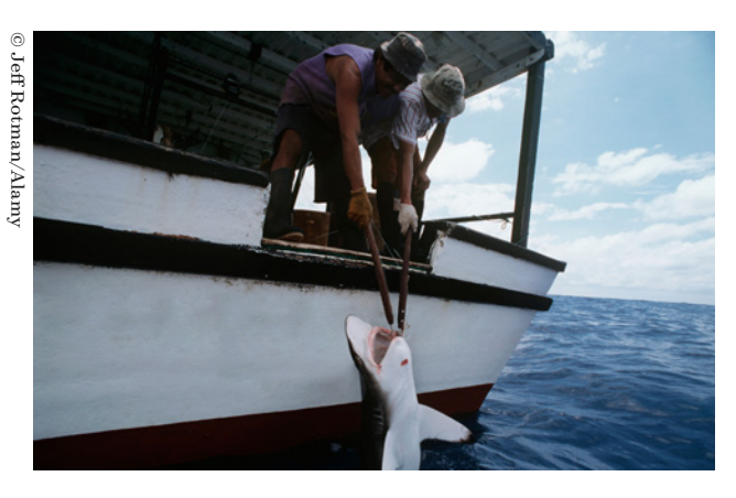
Fishermen haul in a blacktip shark ( Carcharhinus limbatus ) caught on a longline at Cocos Island, Costa Rica, a marine protected area and critical shark habitat.

Some U.S. ports stand out as key transit points for shark fin shipments (Table 1). The majority of in-transit shipments identified through this investigation passed through the port complex of Los Angeles, including the Los Angeles maritime port and the airport (354 metric tons), and the Port of Long Beach (132 metric tons). An additional 274 metric tons of transited fins moved through Miami International Airport. It is important to note, however, that the primary ports for shark fin shipments have shifted in recent years. The Miami Herald reported that first Los Angeles and then Houston served for years as transit hubs for fins from Central America, but that the trade is shifting to Florida in response to fin trade bans in California and Texas.<sup>23</sup> While we found a much smaller volume of fins transiting through Seattle-Tacoma International Airport (a minimum of 12 metric tons), anecdotal evidence suggests fins may pass through this airport frequently, and the majority of the law enforcement cases NRDC identified occurred there.